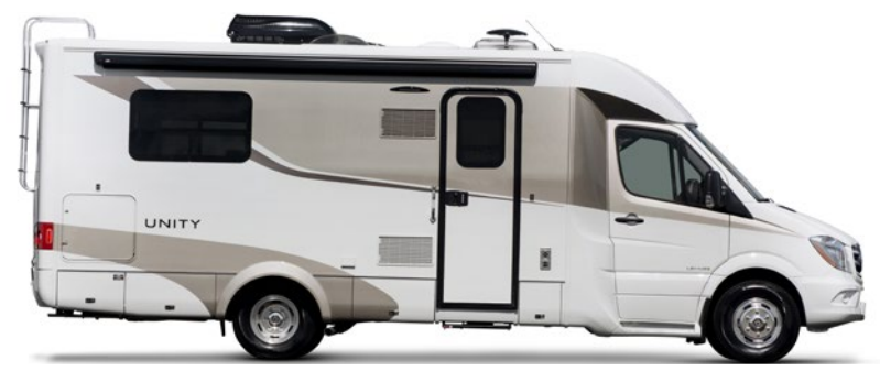
White Suede Shown With Optional Exterior Ladder