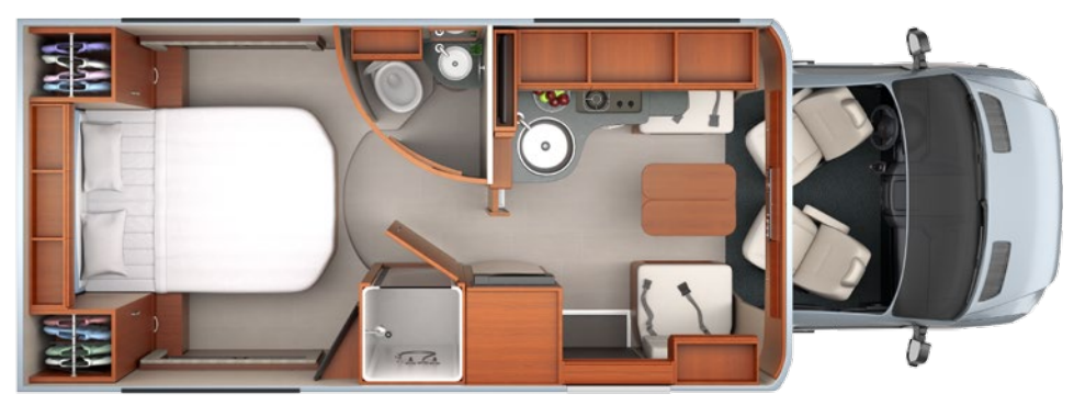
U24IB Island Bed