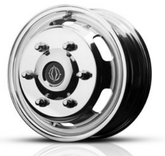
Alcoa Dura-Bright® Aluminum Wheels Optional - All 6 Wheels