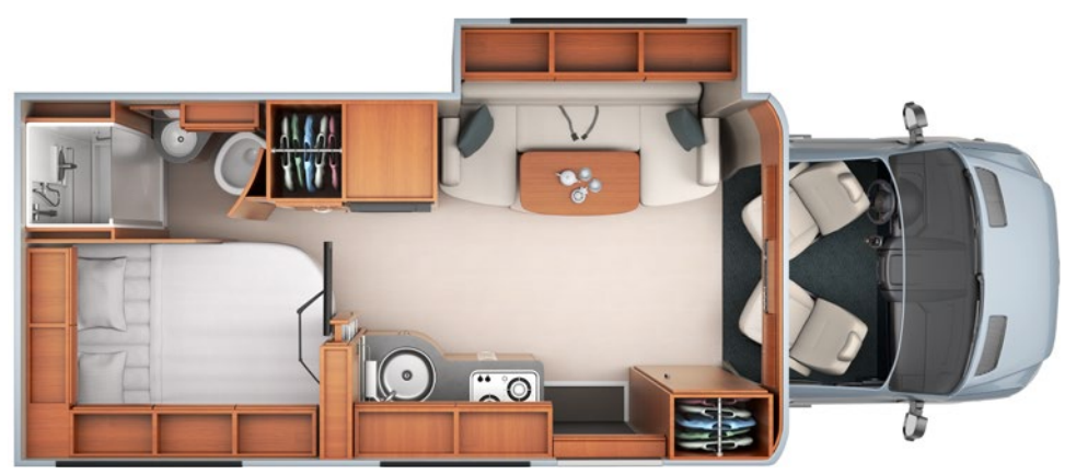
U24CB Corner Bed (Shown with optional U-Lounge Dinette)