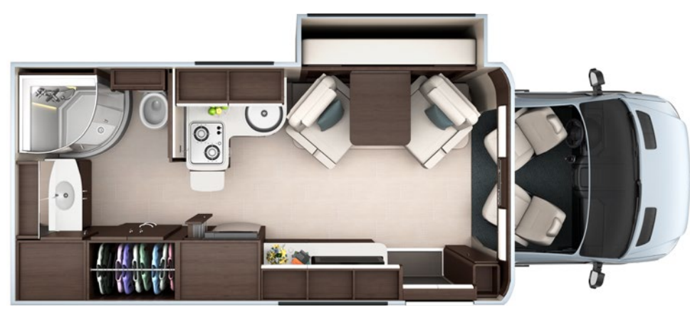
U24MB Murphy Bed (Shown with optional Leisure Lounge Plus)