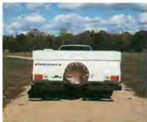
The height of all Starcraft campers is lower than the height of most of today's smaller cars.