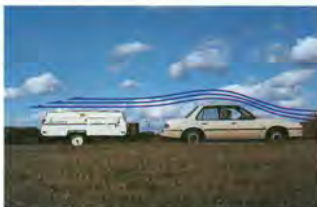
The aerodynamics of the car are really more important than the aerodynamics of the camper. It is the car that interrupts the static air mass. The air then basically flows over the car and camper.