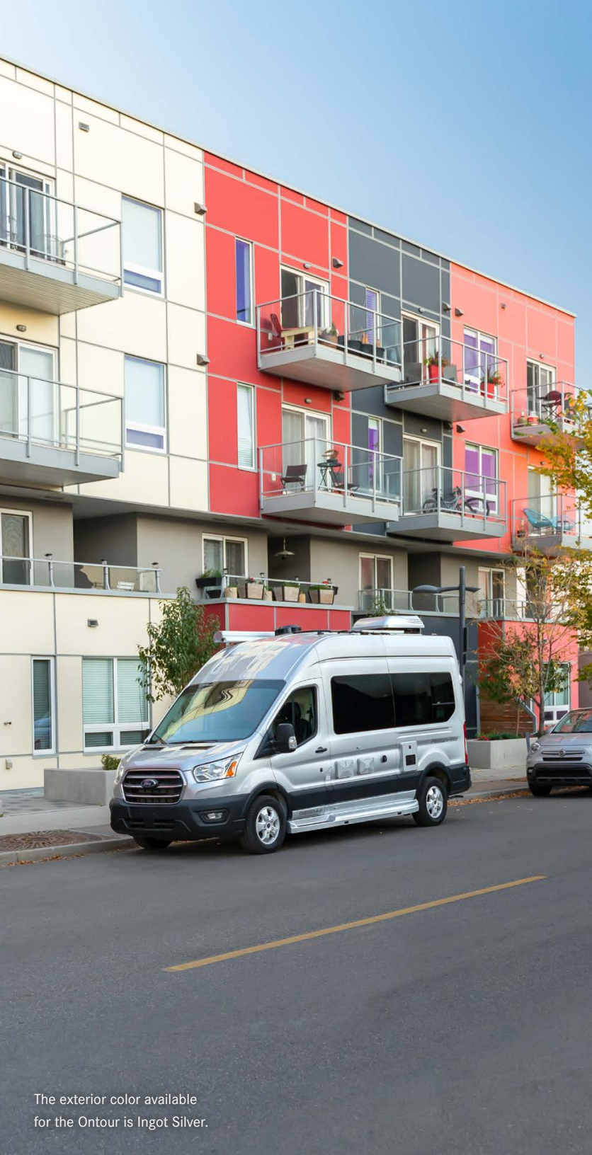
The exterior color available for the Ontour is Ingot Silver.