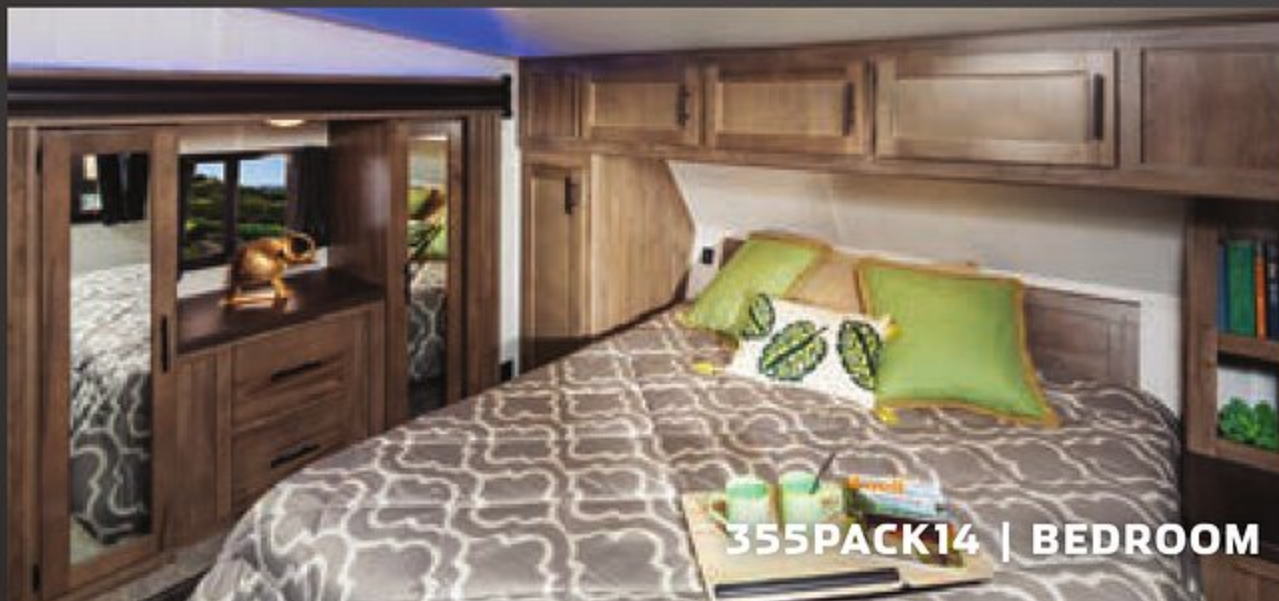
355PACK14 | BEDROOM