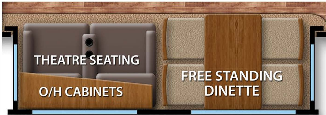
Theatre Seating w/ Free-Standing Dinette (Optional)