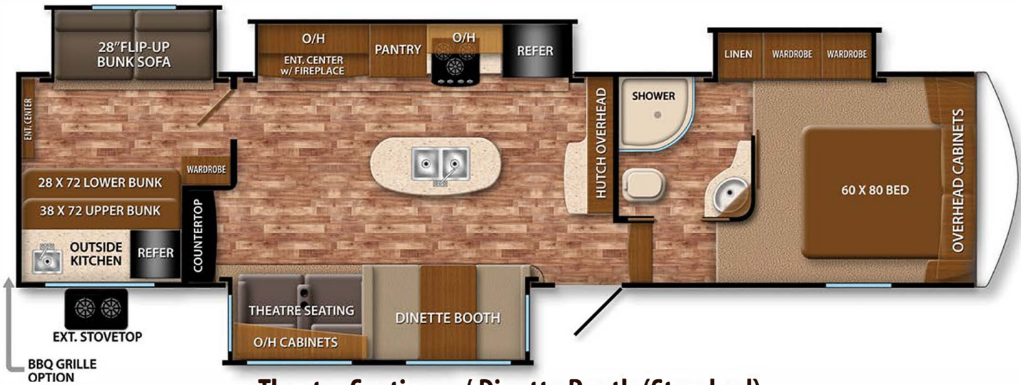
Theatre Seating w/ Dinette Booth (Standard)