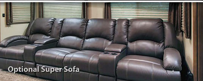
Optional Super Sofa