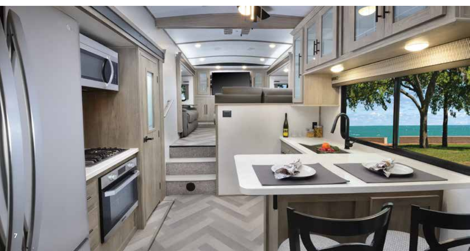
For a more comprehensive look at our floorplans and 360 degree tours, please visit www.forestriverinc.com/wildwood