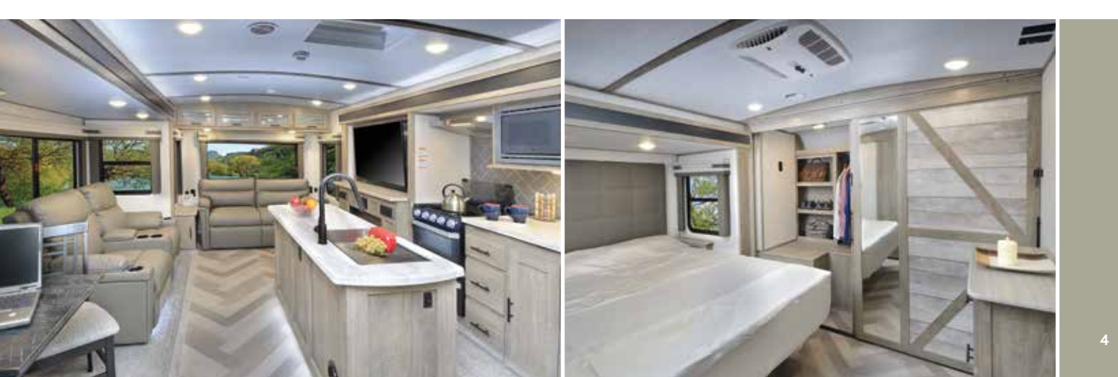
Weight: 8,074 lbs Length: 37' 6"