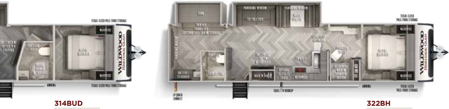
Weight: 8,354 lbs Length: 39'