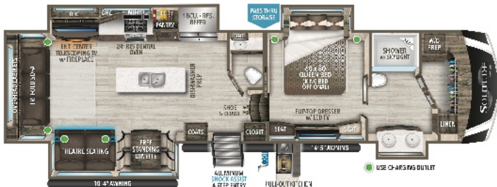
373FB 373FB-R U W ' HITCH' GVWR LENGTH' HEIGHT CAPACITY 13,950 2,800 16,800 41' 4" 13' 5" 93 100 100