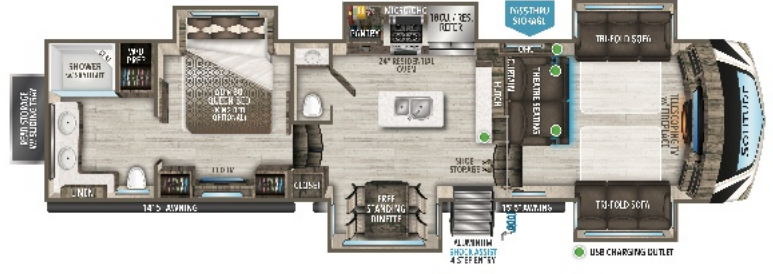
380FL 380FL-R U W ' HITCH' GVWR LENGTH' HEIGHT CAPACITY 14,866 3,052 16,800 41' 5" 13' 5" 93 100 106