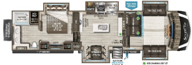
382WB 382WB-R U W ' HITCH' GVWR LENGTH' HEIGHT CAPACITY 14,866 3,052 16,800 41' 5" 13' 5" 93 100 53