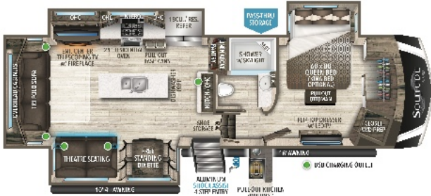
310GK 310GK-R U W ' HITCH' GVWR LENGTH' HEIGHT CAPACITY 12,100 2,350 15,000 34' 11" 13' 5" 93 100 50