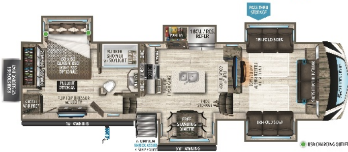
346FLS 346FLS-R U W ' HITCH' GVWR LENGTH' HEIGHT CAPACITY 14,222 3,096 16,800 37' 11" 13' 5" 93 100 50