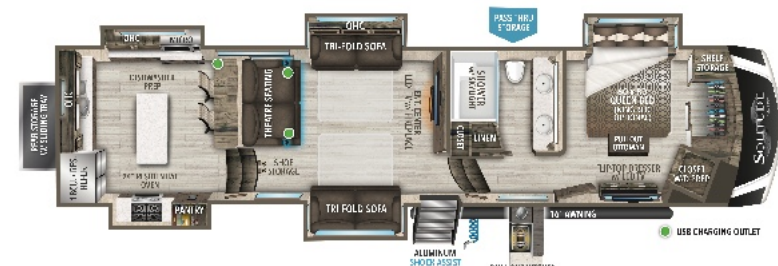
390RK 390RK-R U W ' HITCH' GVWR LENGTH' HEIGHT CAPACITY 14,562 2,794 16,800 41' 5" 13' 5" 93 100 53

Based on average weight of the standard build. * Hitch to rear -R models indicate 18 cu ft. Residential Refrigerator option.