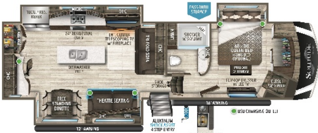
345GK 345GK-R U W ' HITCH' GVWR LENGTH' HEIGHT CAPACITY 13,320 2,604 16,800 37' 2" 13' 5" 93 100 50