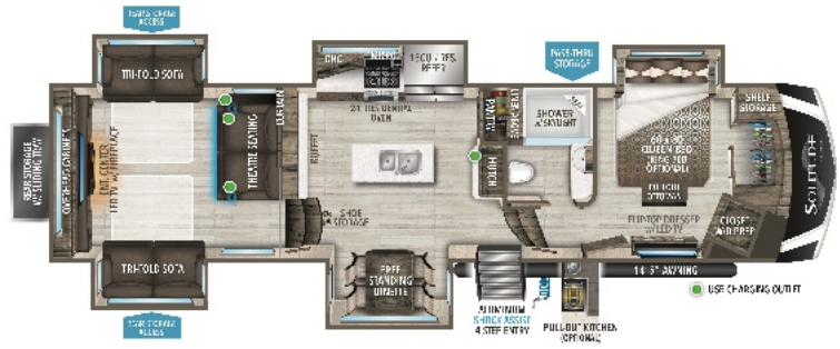
375RES 375RES-R U W ' HITCH' GVWR LENGTH' HEIGHT CAPACITY 14,200 2,900 16,800 41' 4" 13' 5" 93 100 50