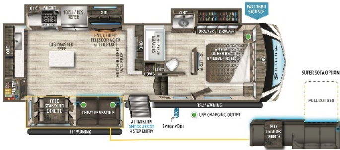
280RK 280RK-R U W ' HITCH' GVWR LENGTH' HEIGHT CAPACITY 12,334 2,044 15,000 32' 7" 13' 5" 93 100 53