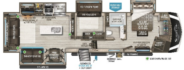
378MBS 378MBS-R U W ' HITCH' GVWR LENGTH' HEIGHT CAPACITY 14,344 2,686 16,800 40' 2" 13' 5" 93 100 50