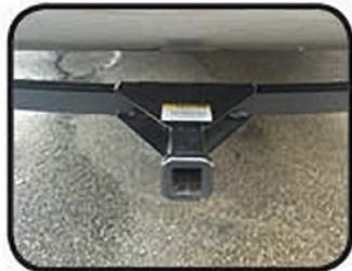
REAR ACCESSORY HITCH