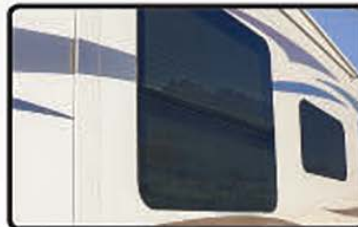
UPGRADE FRAMELESS WINDOWS