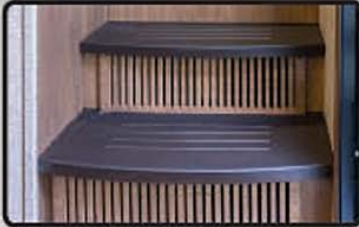
HARD SURFACE INTERIOR STEPS