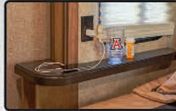
WRAP AROUND HARDWOOD NIGHT STANDS W/OUTLETS AND CUBBY STORAGE