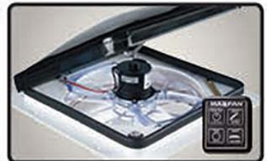
KITCHEN POWER RAIN SENSOR VENT FAN W/MULTI-SPEED WALL CONTROL