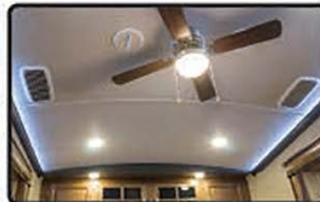
DUAL 15K QUIET COOL AIR CONDITIONING SYSTEM