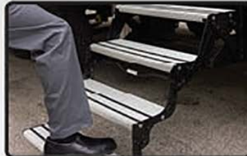
FOUR STEP ALUMINUM STEP TREADS FOR CONVENIENCE/COMFORT