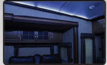
BACK-LIT CROWN MOLDING AMBIENT CEILING LIGHT