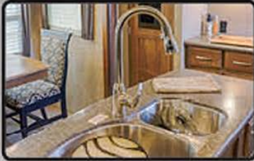
70/30 SINK W/PULL OUT FAUCET W/SOLID SURFACE SINK COVERS