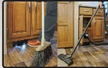
CENTRAL VACUUM W/KITCHEN TOE KICK W/ BOTH INTERIOR & EXTERIOR HOSE PORTS