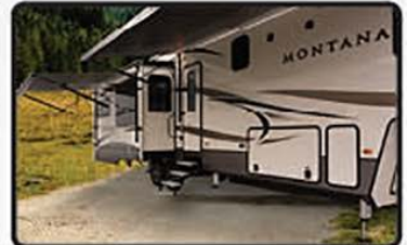
2ND PATIO AWNING W/LED LIGHT STRIP (SELECT MODELS)