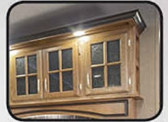
HARDWOOD CHERRY CABINET FRAMING (STILES)