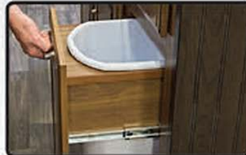
PULL OUT KITCHEN TRASH CAN STORAGE (SELECT MODELS)