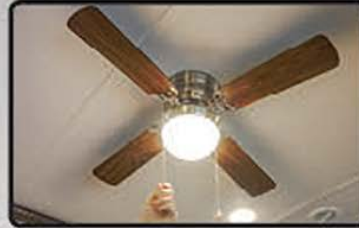
CEILING FAN WITH LIGHT KIT