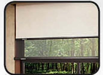
UPGRADE DAY/NIGHT ROLLER SHADES