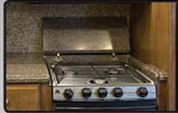
SOLID SURFACE HINGED RANGE COVER