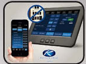
iN-COMMAND CONTROL SYSTEMS