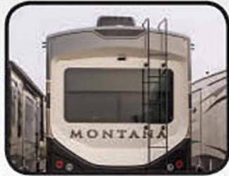
DECORATIVE FIBERGLASS REAR CAP (N/A 3790, 3791)