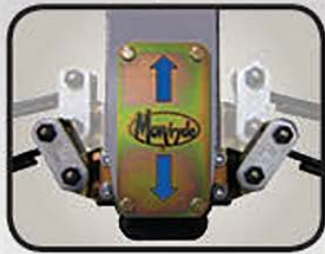
EXCLUSIVE MOR/RIDE 4100 SUSPENSION SYSTEM W/ WET BOLTS