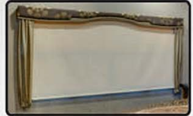
UPGRADE BLACKOUT ROLLER SHADES THROUGHOUT