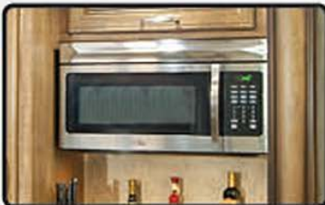
30" RESIDENTIAL CONVECTION MICROWAVE