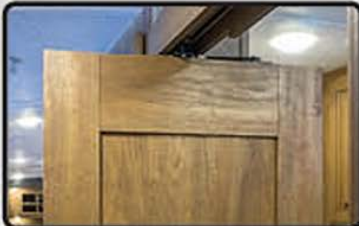
CLEVER SPACE SAVING PIVOT HINGE BATH DOOR