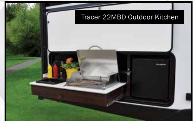
Tracer 22MBD Outdoor Kitchen