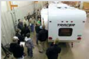
Executive Quality Audits