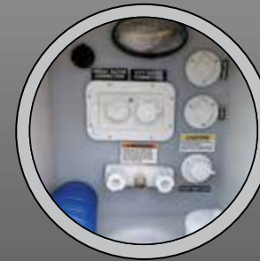
UNIVERSAL DOCKING CENTER (N/A BREEZE)