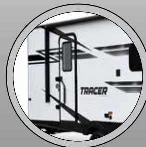
FRICTION HINGE ENTRY DOOR