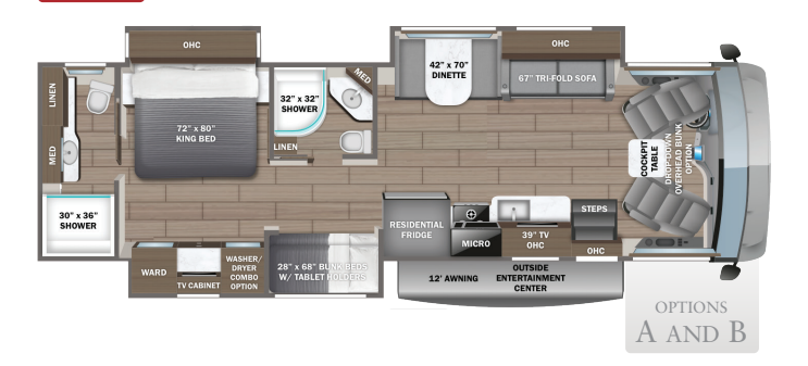
- OPTIONS -