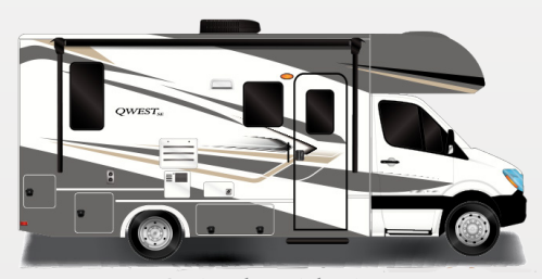
Optional Partial Paint