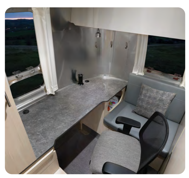
Full desk that converts into additional sleeping space (30FB Office)