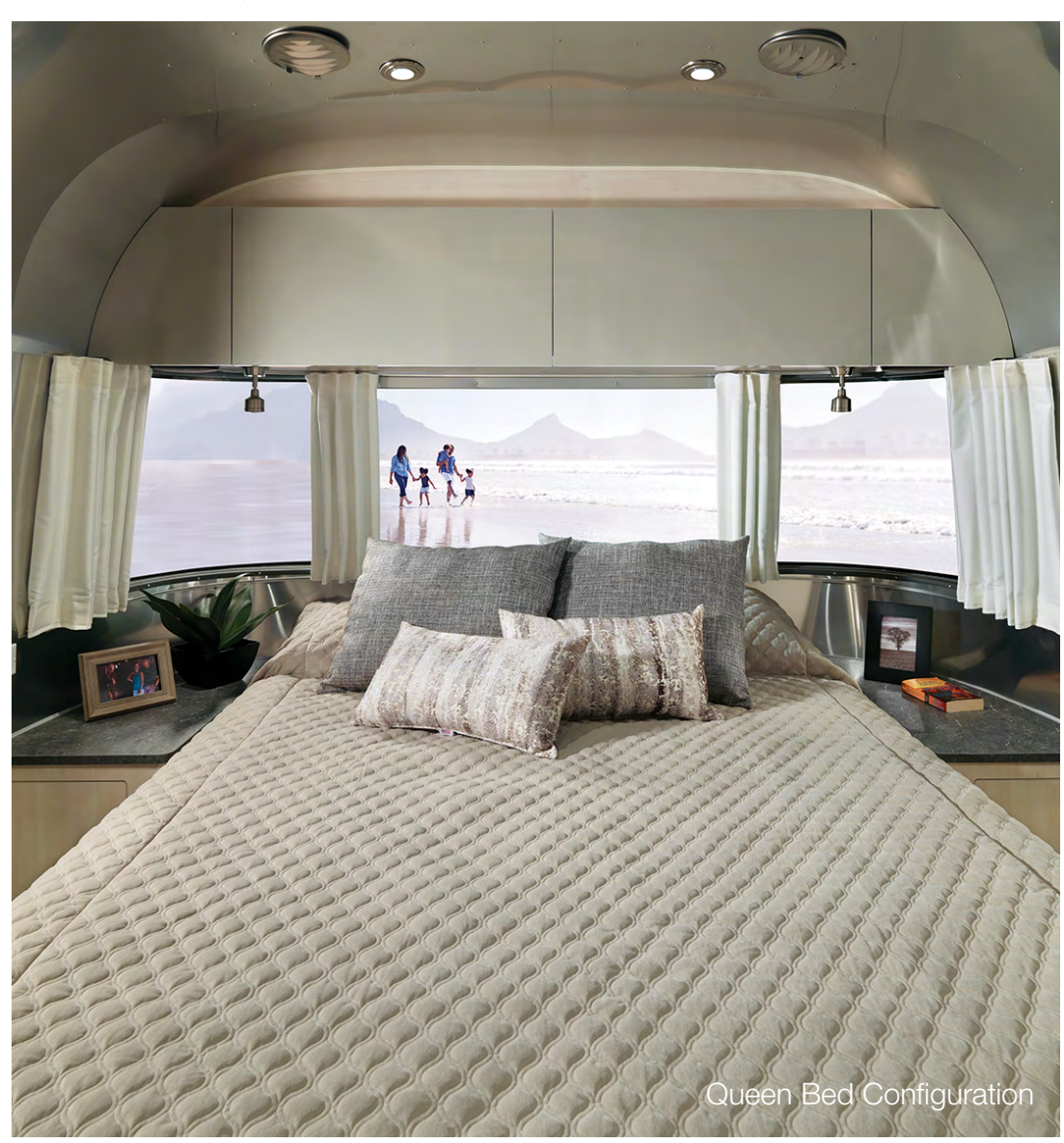
Choice of Either Queen or Twin Beds