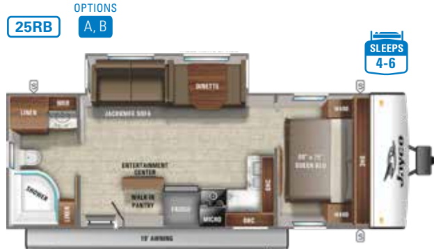
Ext. Lgth: 30' 7" Weight: 5,850 lbs. Hitch: 630 lbs.