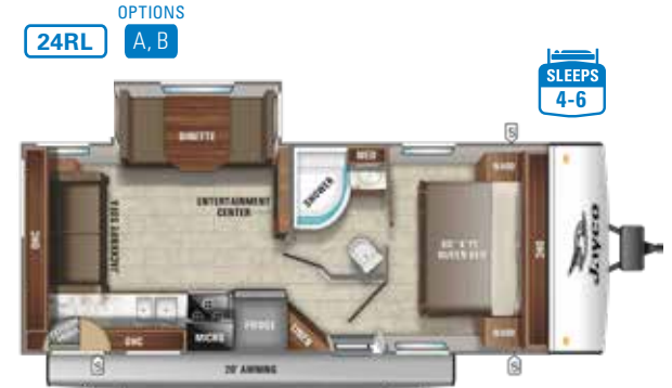
Ext. Lgth: 28' 7" Weight: 5,360 lbs. Hitch: 650 lbs.