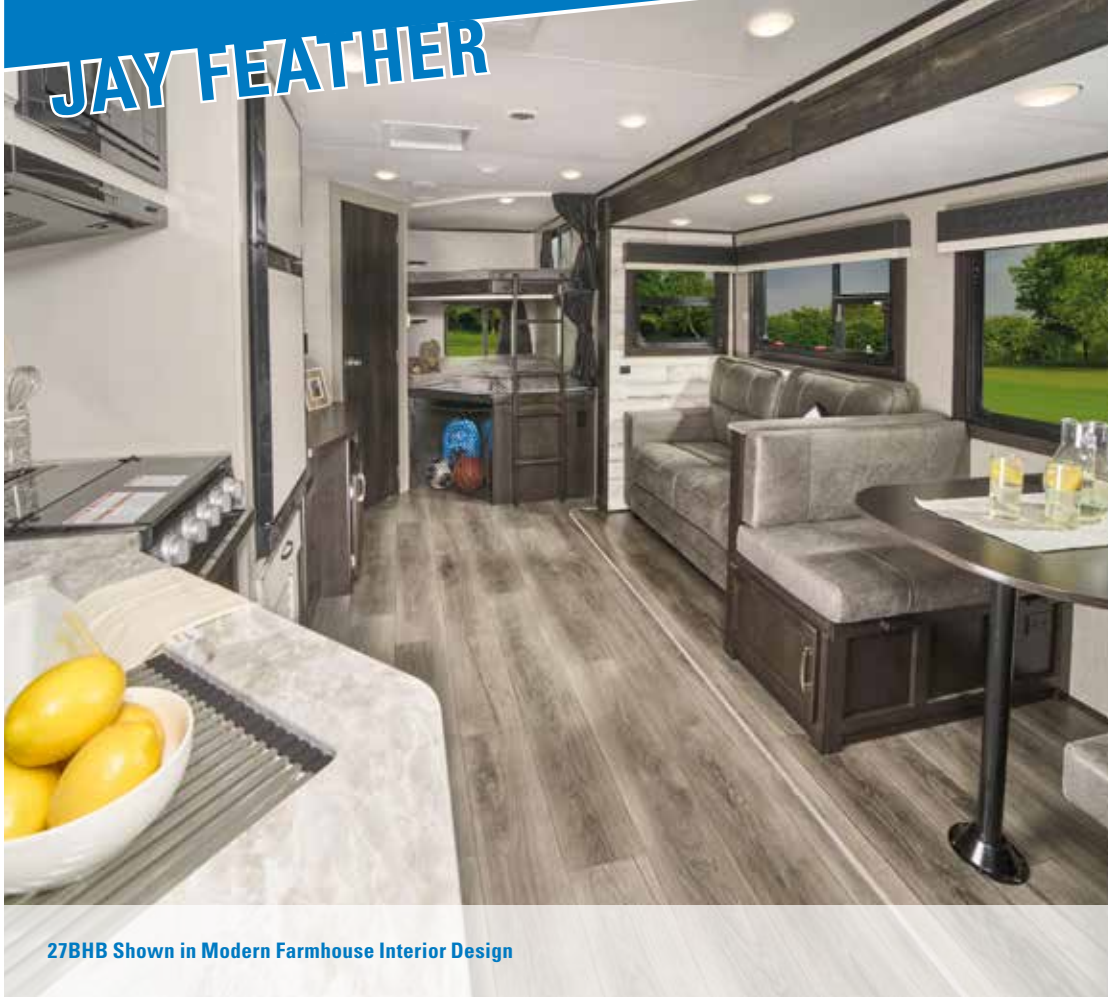
27BHB Shown in Modern Farmhouse Interior Design