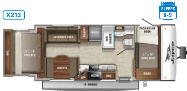
Ext. Lgth: 24' 2" Weight: 4,625 lbs. Hitch: 495 lbs.