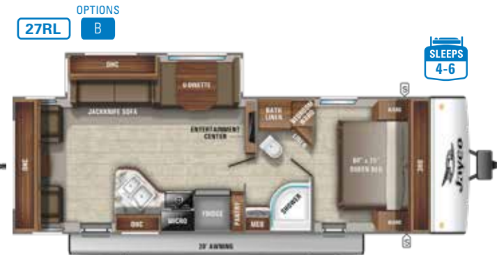
Ext. Lgth: 31' 8" Weight: 6,030 lbs. Hitch: 730 lbs.