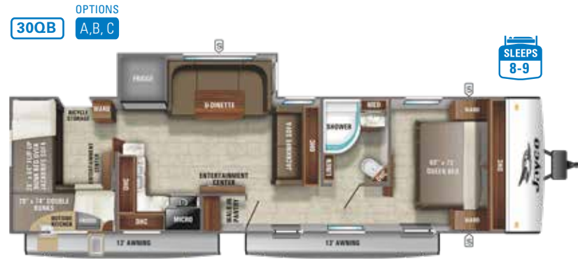
Ext. Lgth: 36' 11" Weight: 7,295 lbs. Hitch: 835 lbs.