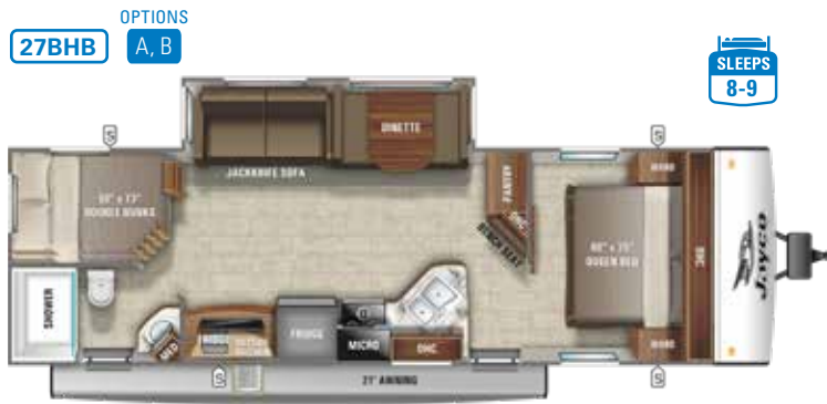
Ext. Lgth: 33' 1" Weight: 6,300 lbs. Hitch: 695 lbs.