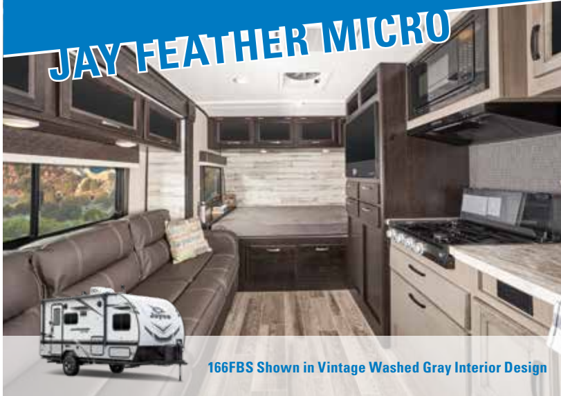
166FBS Shown in Vintage Washed Gray Interior Design