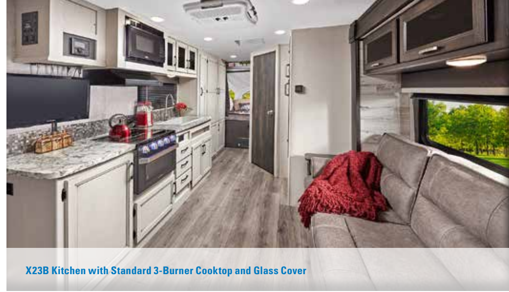
X23B Kitchen with Standard 3-Burner Cooktop and Glass Cover