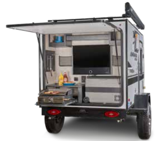
12SRK Exterior Kitchen with Blackstone® Griddle