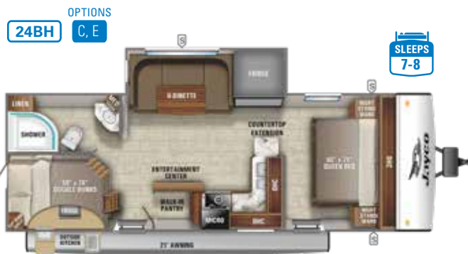
Ext. Lgth: 30' 2" Weight: 6,220 lbs. Hitch: 660 lbs.