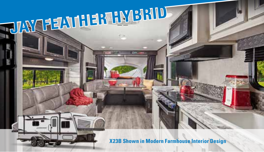
X23B Shown in Modern Farmhouse Interior Design