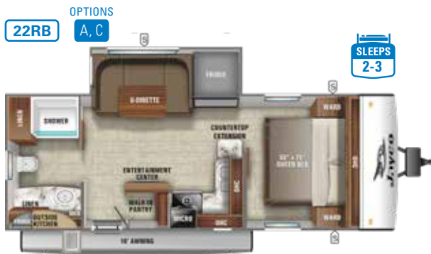
Ext. Lgth: 27' 9" Weight: 5,655 lbs. Hitch: 660 lbs.