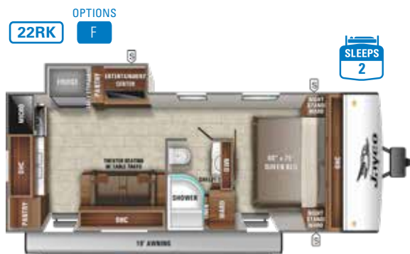
Ext. Lgth: 27' 10" Weight: 5,490 lbs. Hitch: 530 lbs.