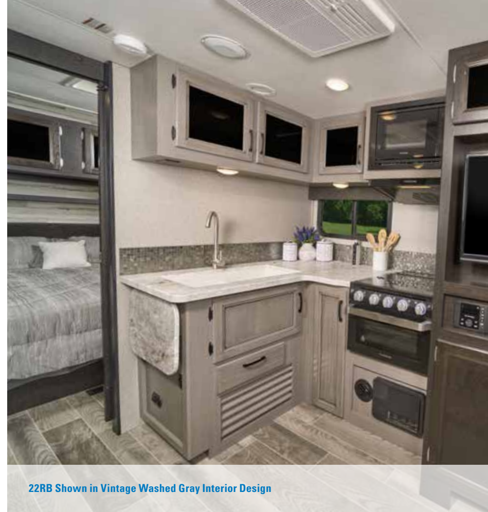
22RB Shown in Vintage Washed Gray Interior Design