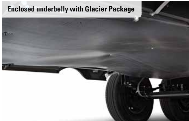
Enclosed underbelly with Glacier Package