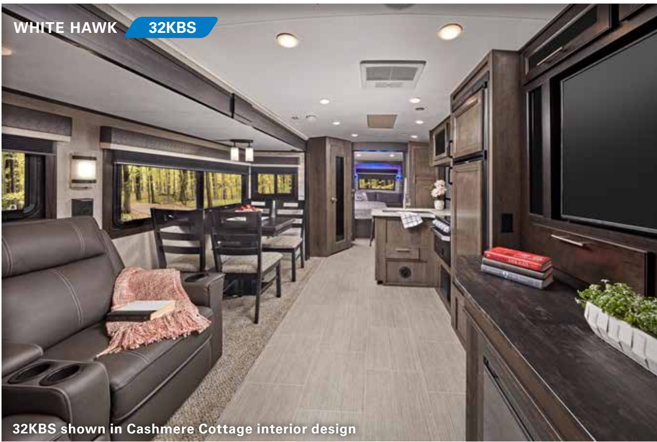
32KBS shown in Cashmere Cottage interior design