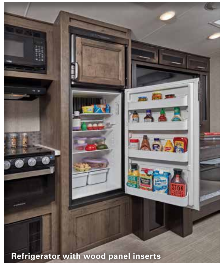
Refrigerator with wood panel inserts