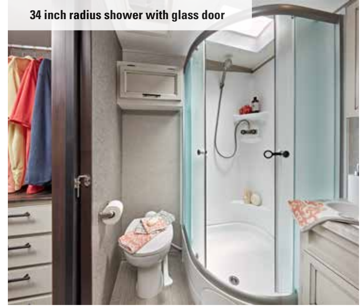
34 inch radius shower with glass door