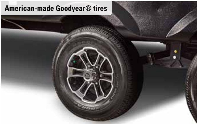
American-made Goodyear® tires