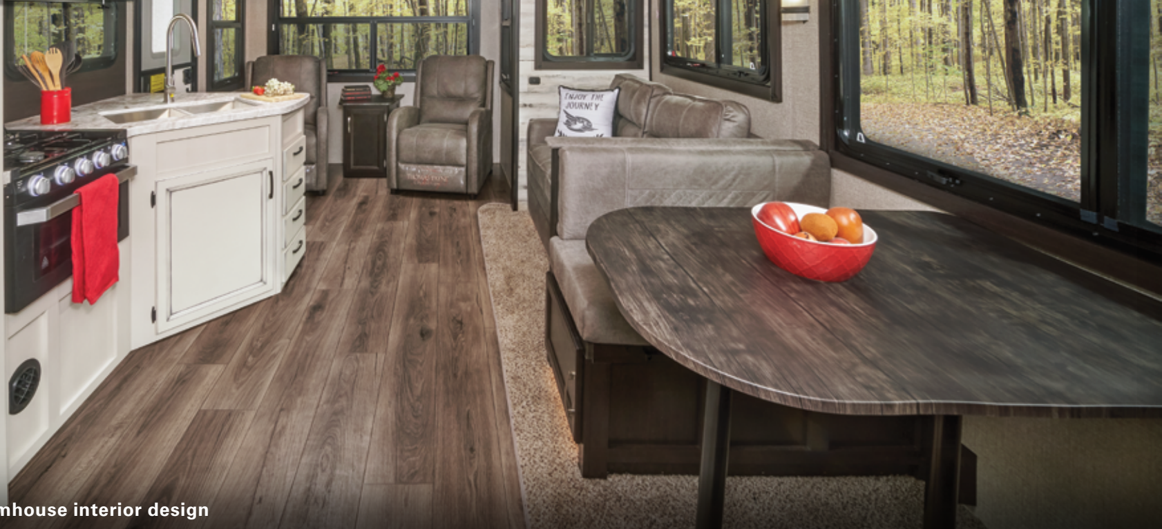
28RL shown in Modern Farmhouse interior design