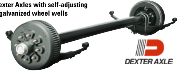
American-Made Dexter Axles with self-adjusting brakes and galvanized wheel wells