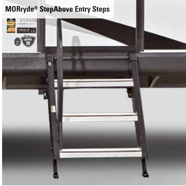
MORryde® StepAbove Entry Steps