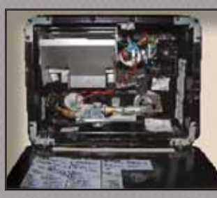
Tracer's high efficiency water heater allows users up to 18 gallons of hot water per hour!