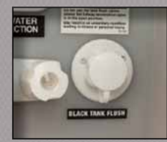
The black tank flush makes emptying the tank a clean, easy process!