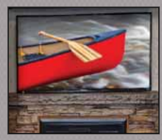
All Tracers have LED TV's to provide exceptional viewing quality.