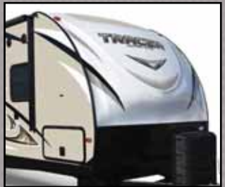
Tracer provides diamond plate Protection to protect your investment.