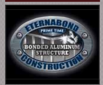
Tracer is built with Prime Time's ETERNABOND® Construction Technology.