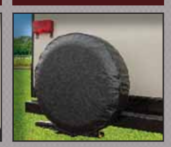
Tracer's spare tire affords peace of mind on board your home away from home!