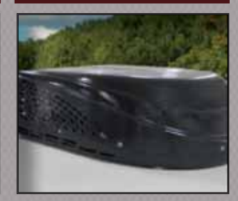
Tracer and Tracer AIR feature residential style ducted A/C for even cooling throughout the unit.