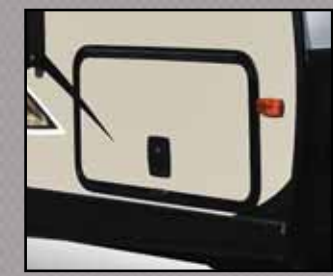
You don't have to buy a diesel motor home to get the security and convenience of bus style slam latch baggage doors.