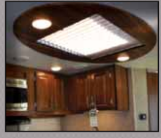
The extra-large skylight adds great natural lighting to the unit's interior.