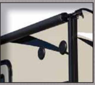
Your entertainment options are multiplied with Tracer's exterior speakers.