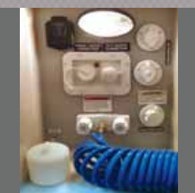
The Universal Docking Station provides easy setup for your camping experience and protects hookups from the elements!