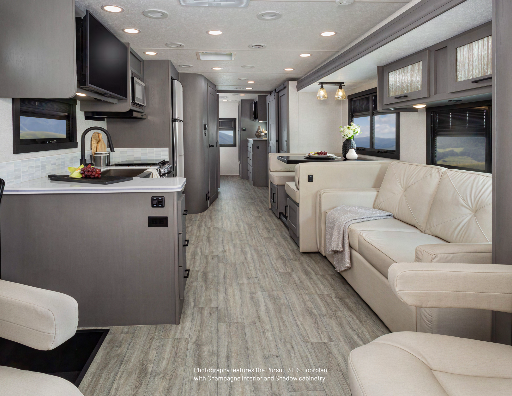
Photography features the Pursuit 31ES floorplan with Champagne interior and Shadow cabinetry.