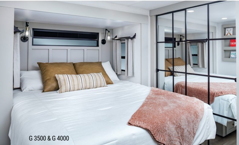
G 3500 & G 4000