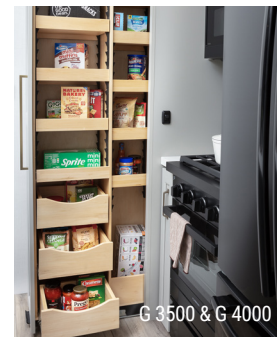
G 3500 & G 4000