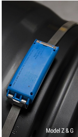
Model Z & G