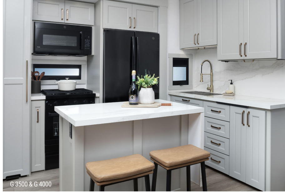
G 3500 & G 4000