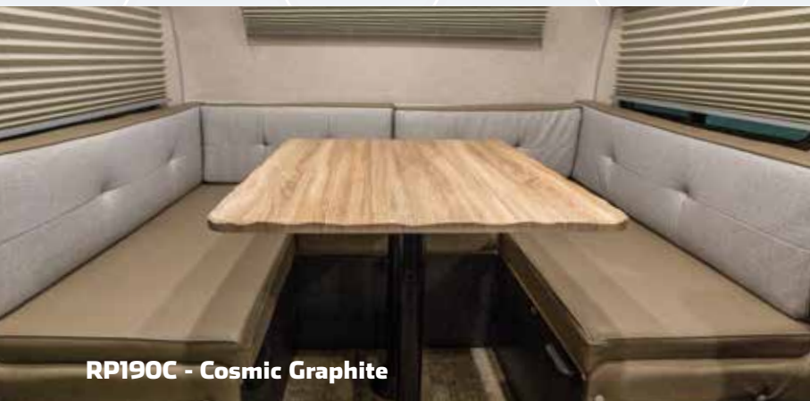
RP190C - Cosmic Graphite