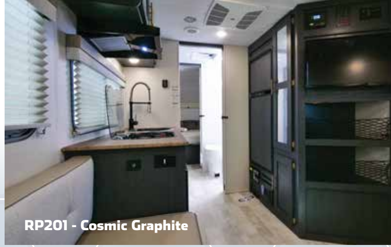
RP201 - Cosmic Graphite

R-Pod's Beast Mode models are fully loaded with brand new standard features! We make it easy to cook at campsites with our popular Outdoor Bush Kitchen . Worried about tire safety? We have you covered with TST, a standard Tire Pressure Monitoring System with internal sensors mounted inside your tire. Do you like to camp off-grid? You're in luck! All Beast Mode models now come with a Large Solar Panel , 30-Amp controller, and a 2000-Watt Inverter which means you can plug in larger appliances (hair dryer, blender, toaster, coffee maker) on any interior outlet. You won't want to miss out on the brand-new Cosmic Graphite interior décor and exterior graphics that are out of this world!