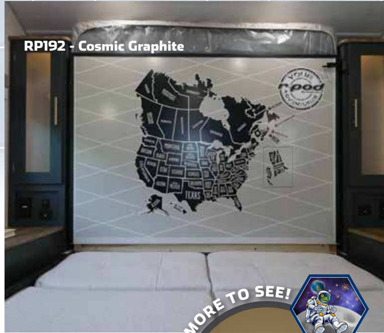
RP192 - Cosmic Graphite