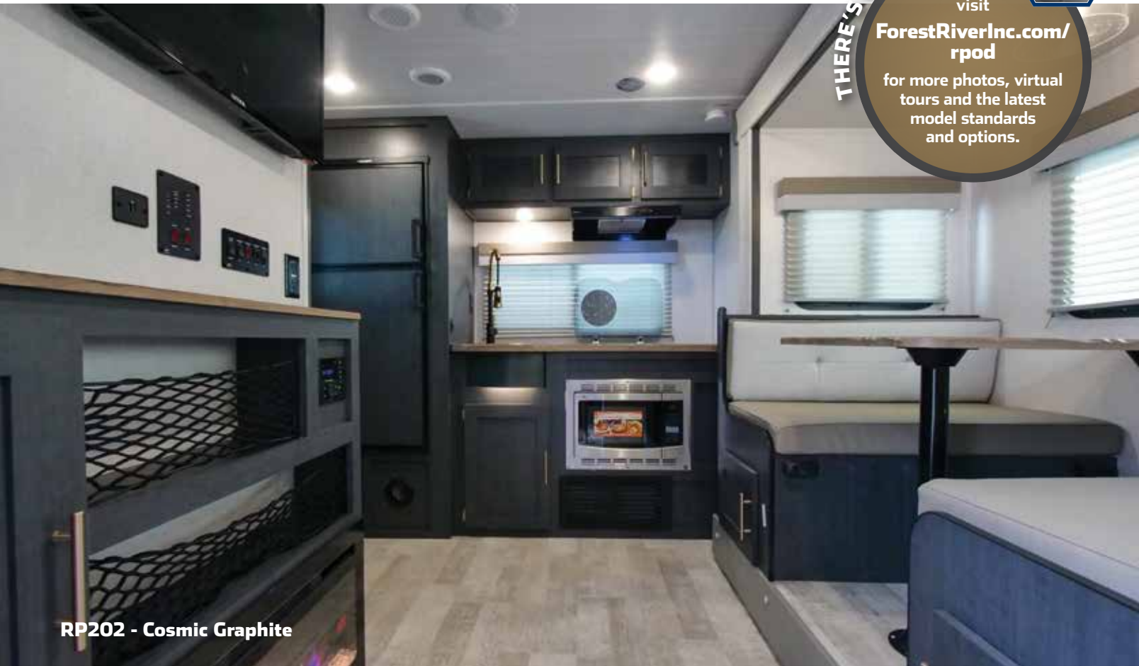
RP202 - Cosmic Graphite

for more photos, virtual tours and the latest model standards and options.