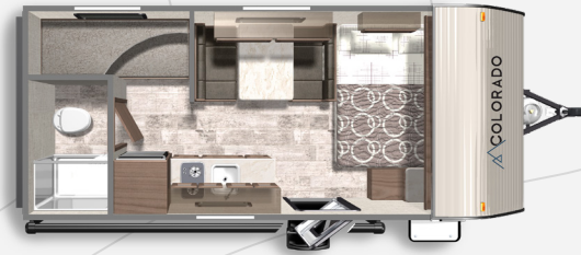
COLORADO 17BHC Length: 21' 5" Weight: 3,069 lbs. Sleeps: 4-6 Hitch: 396 lbs. Height: 9' 2"