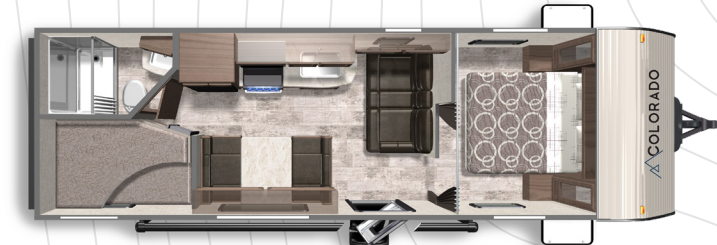
COLORADO 24BHC Length: 28' 8" Weight: 4,739 lbs. Sleeps: 6-8 Hitch: 487 lbs. Height: 10' 6"