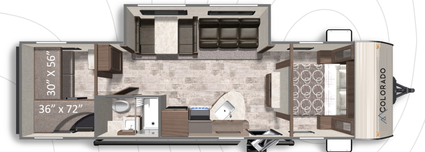
COLORADO 29BHC Length: 33' 3" Weight: 6,481 lbs. Sleeps: 7-9 Hitch: 821 lbs. Height: 11' 3"