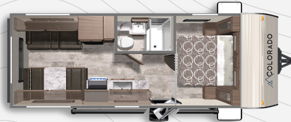
COLORADO 21RDC Length: 25' 5" Weight: 4,495 lbs. Sleeps: 4-6 Hitch: 602 lbs. Height: 11' 3"