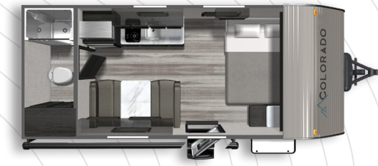
COLORADO 17RBC Length: 21' 3" Weight: 3,588 lbs. Sleeps: 2-3 Hitch: 548 lbs. Height: 9' 3"