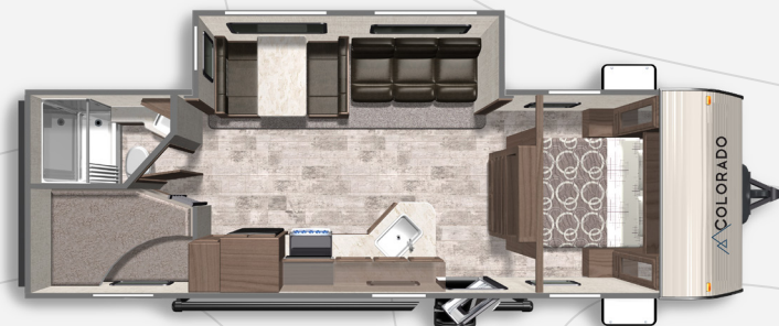
COLORADO 26BHC Length: 30' 10" Weight: 5,957 lbs. Sleeps: 7-9 Hitch: 810 lbs. Height: 11' 1"