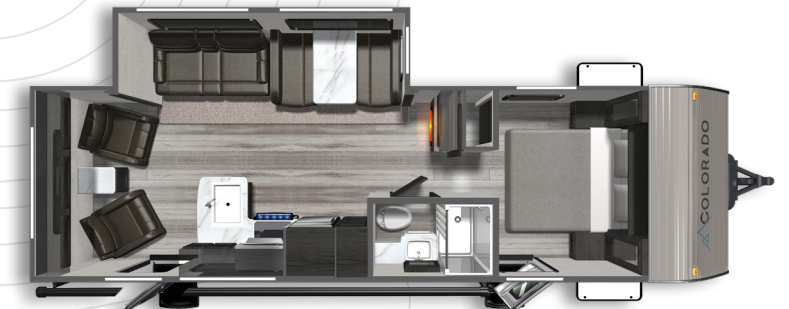
COLORADO 26RLC Length: 30' 11" Weight: 6,217 lbs. Sleeps: 2-4 Hitch: 761 lbs. Height: 11' 1"