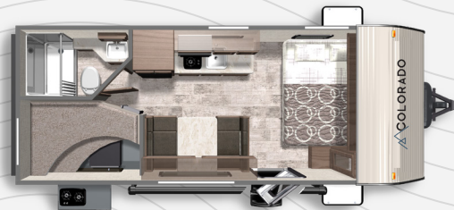
COLORADO 19BHC Length: 23' 5" Weight: 3,672 lbs. Sleeps: 4-6 Hitch: 510 lbs. Height: 9' 11"