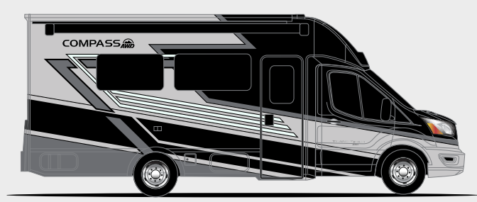
TRUE NORTH 4 FULL-BODY PAINT