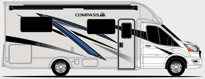
DRESS BLUE MHD-MAX