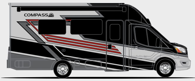
FIBRE OPTIC 4 FULL-BODY PAINT