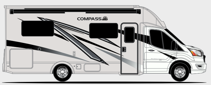
BLACK ICE MHD-MAX