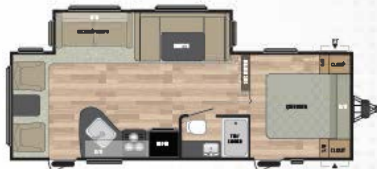
2660RL WEIGHT: 6057 LENGTH: 28' 11"