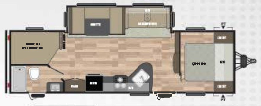
2820BH WEIGHT: 6597 LENGTH: 32' 1"