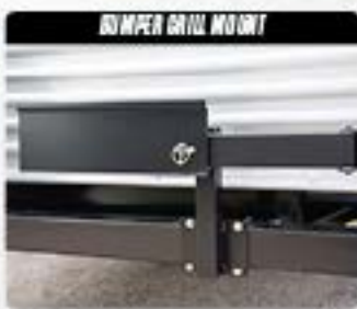
BUMPER GRILL MOUNT