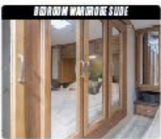
BEDROOM WARDROBE SLIDE