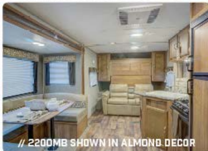
// 2200MB SHOWN IN ALMOND DECOR