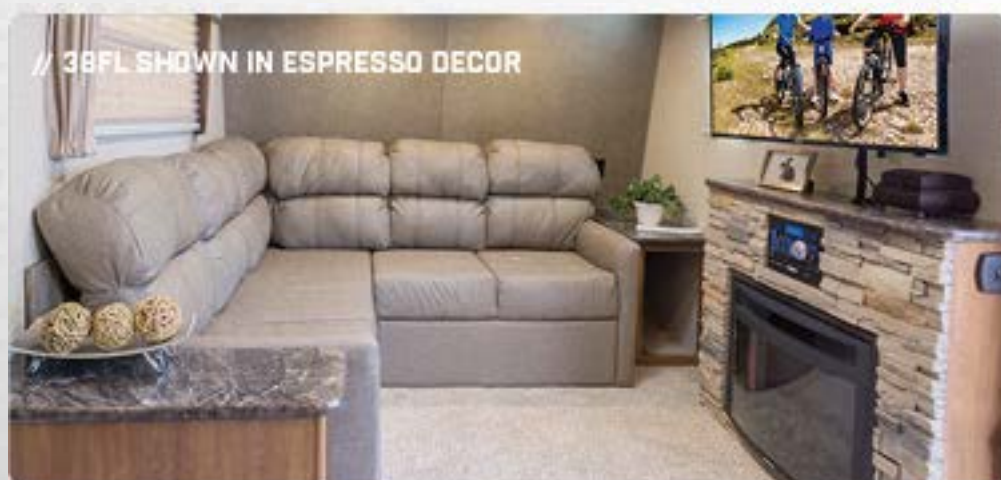
// 38FL SHOWN IN ESPRESSO DECOR