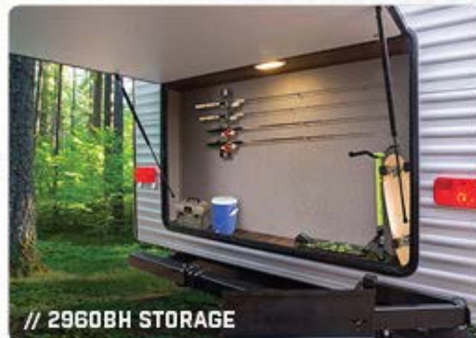
// 2960BH STORAGE