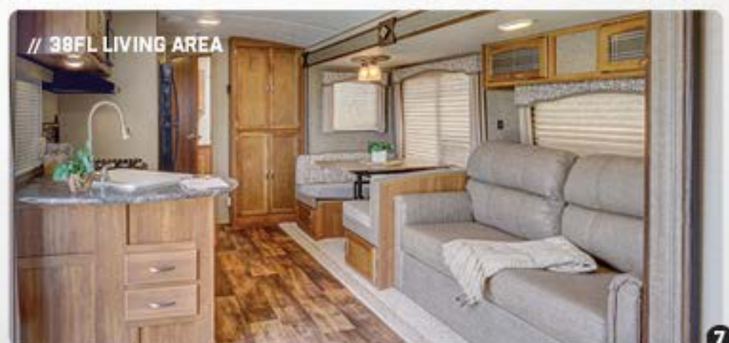
// 38FL LIVING AREA