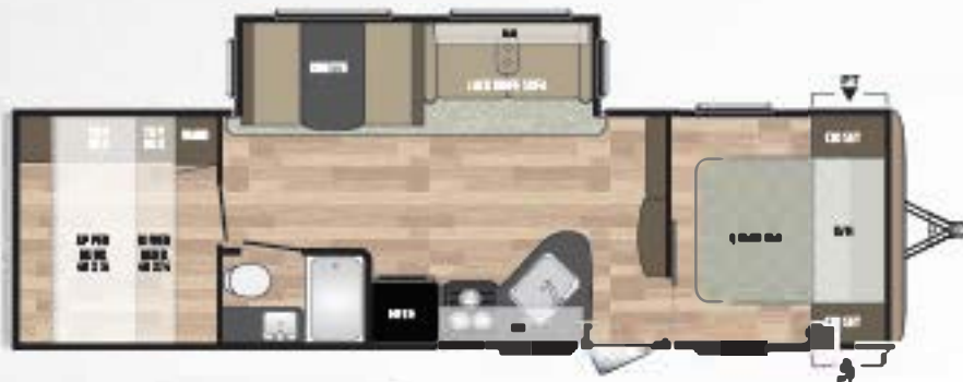
2960BH WEIGHT: 6701 LENGTH: 32' 2"