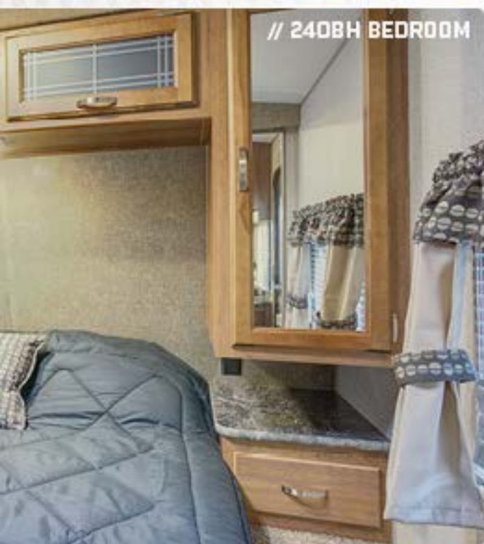
// 240BH BEDROOM