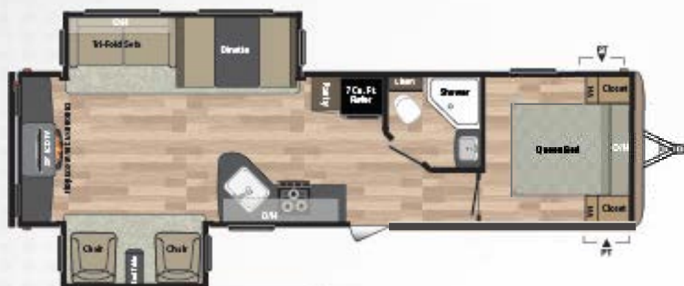
311RE WEIGHT: 8343 LENGTH: 35' 7"