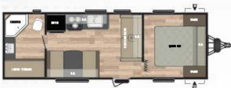
2450RB WEIGHT: 5033 LENGTH: 26' 2"