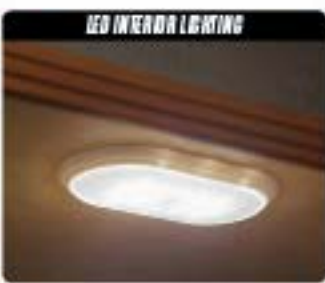
LED INTERIOR LIGHTING