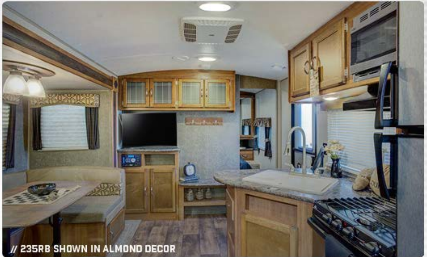
// 235RB SHOWN IN ALMOND DECOR