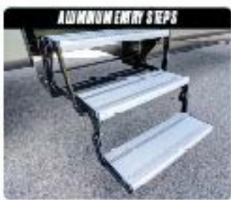
ALUMINUM ENTRY STEPS