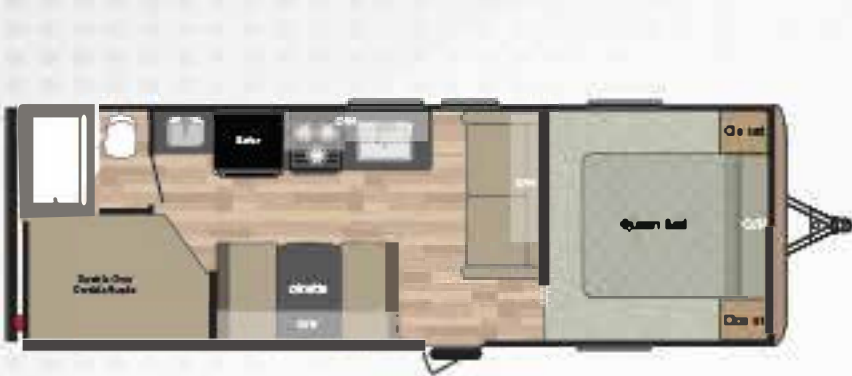
260LE WEIGHT: 5210 LENGTH: 28' 10"