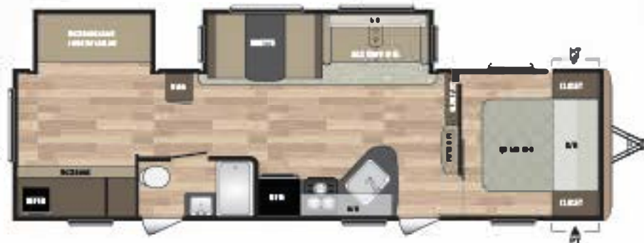
3030BH WEIGHT: 7641 LENGTH: 34' 11"