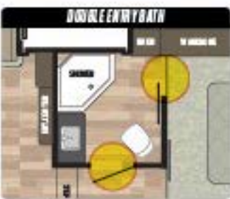
DOUBLE ENTRY BATH