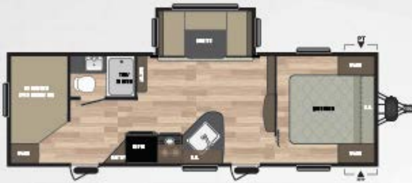
2720BH WEIGHT: 6105 LENGTH: 30' 0"