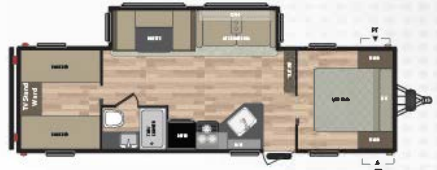
2980BH WEIGHT: 6528 LENGTH: 32' 7"