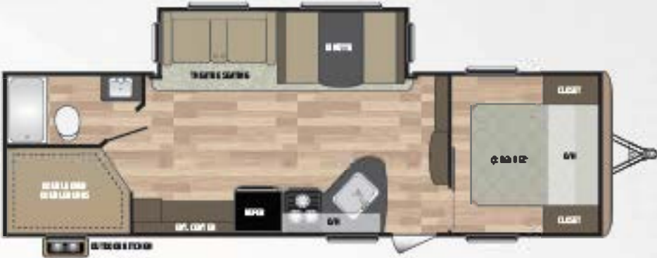
270LE WEIGHT: 7050 LENGTH: 32' 11"