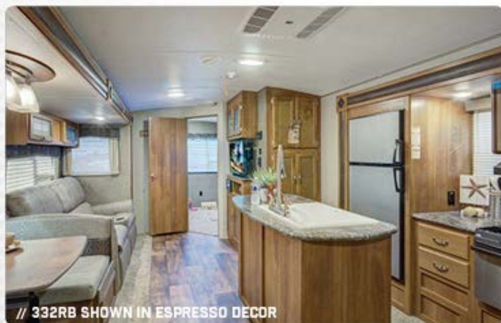
// 332RB SHOWN IN ESPRESSO DECOR