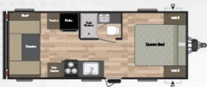
2020QB WEIGHT: 4279 LENGTH: 24' 10"