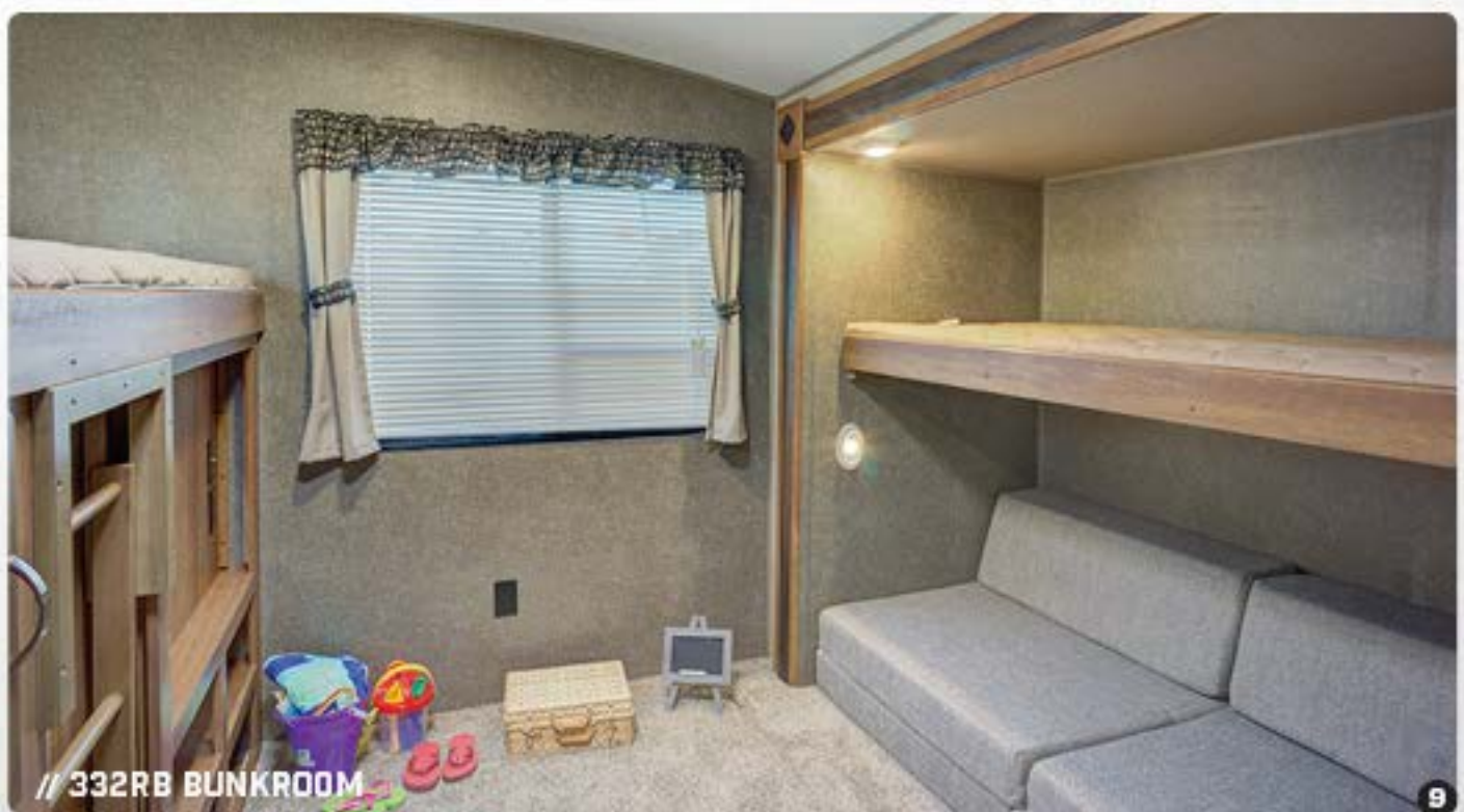
// 332RB BUNKROOM