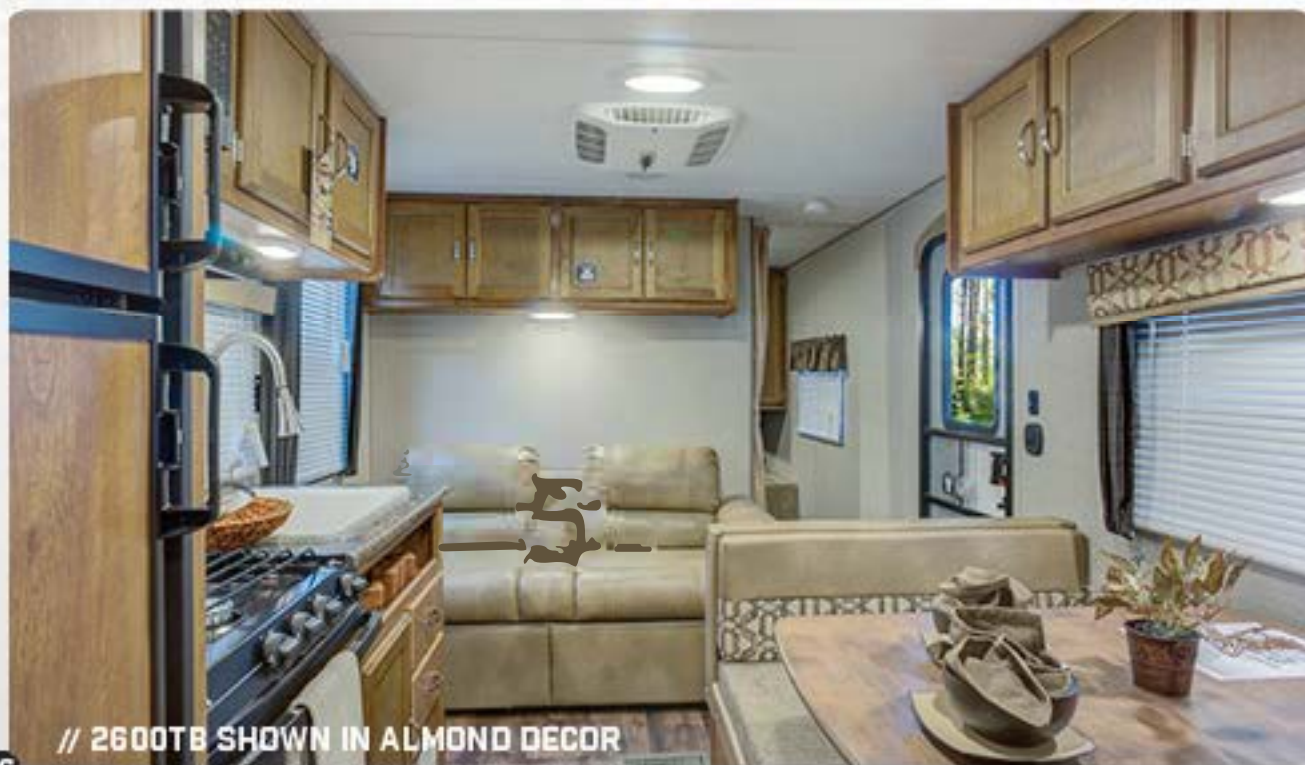
// 2600TB SHOWN IN ALMOND DECOR