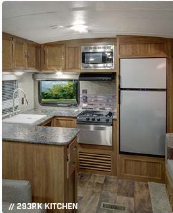
// 293RK KITCHEN