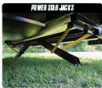
POWER SLIDE JACKS