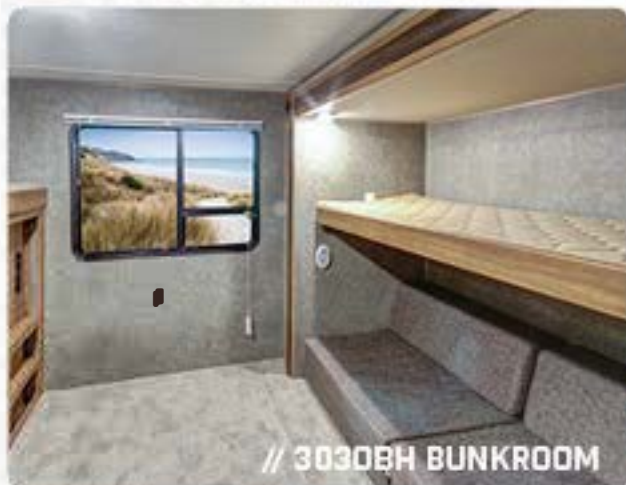
// 3030BH BUNKROOM