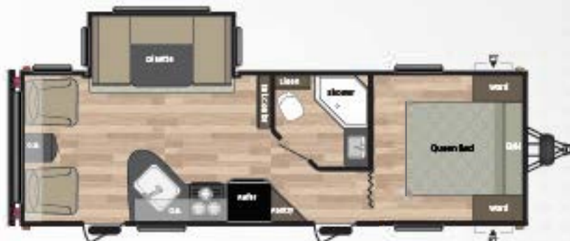
2570RL WEIGHT: 6005 LENGTH: 29' 9"