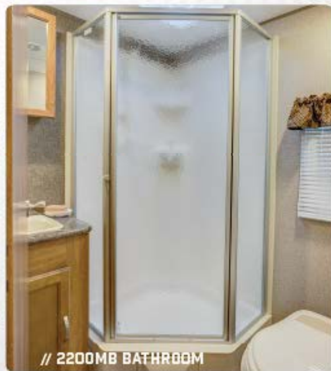
// 2200MB BATHROOM