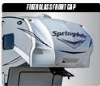
FIBERGLASS FRONT CAP