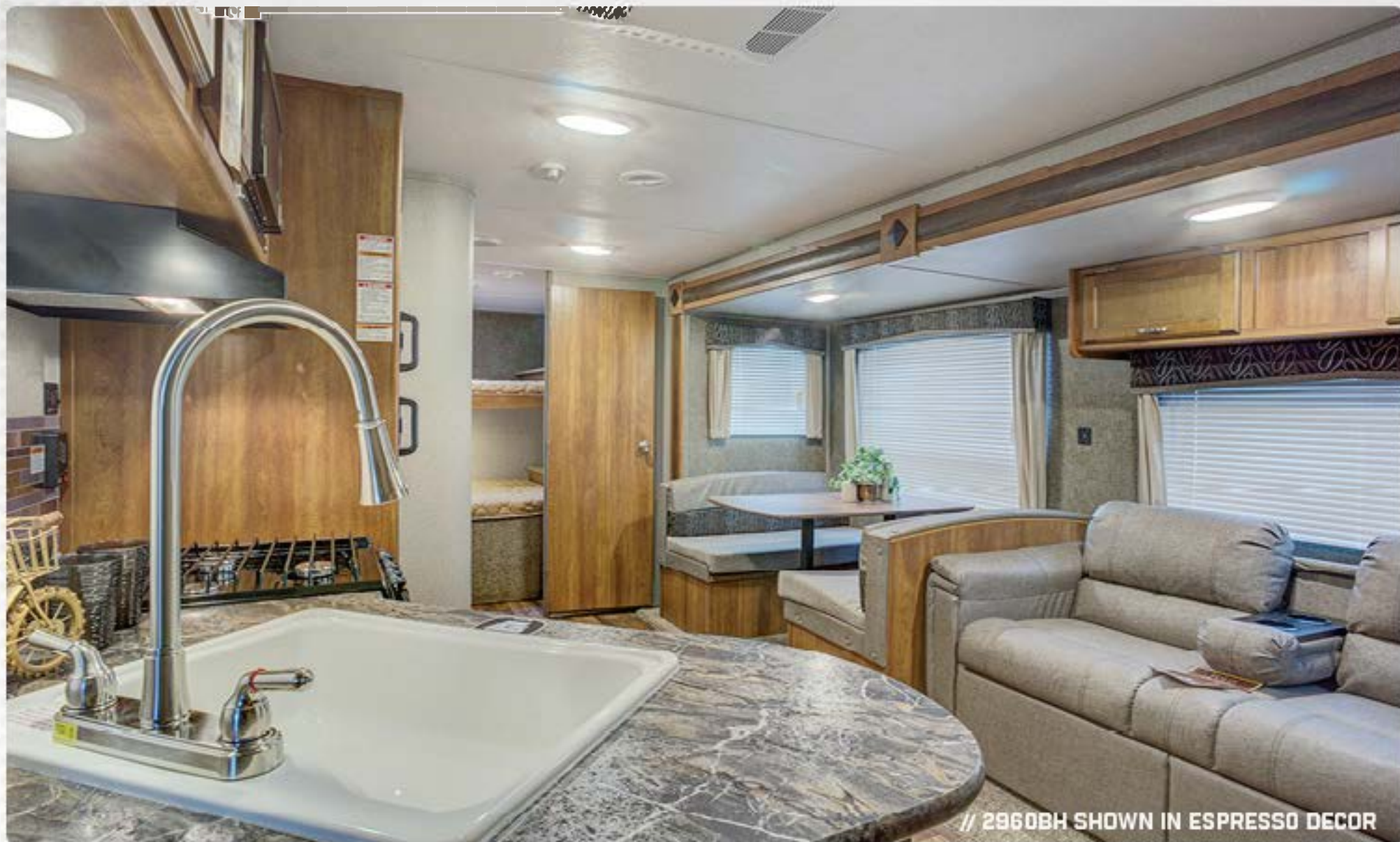
// 2960BH SHOWN IN ESPRESSO DECOR