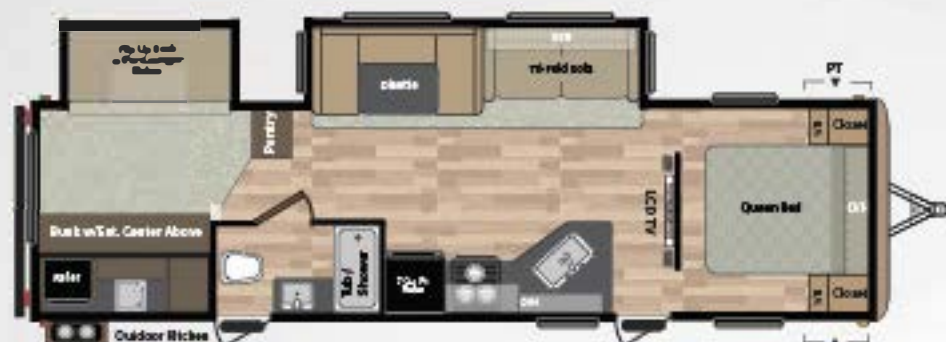
303BH WEIGHT: 8086 LENGTH: 35' 0"