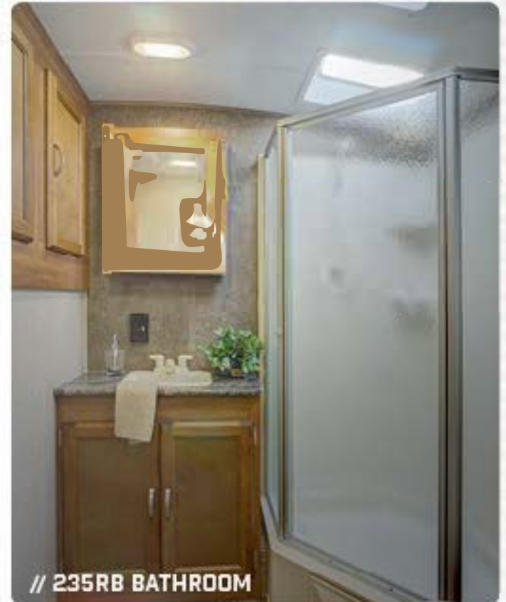
// 235RB BATHROOM