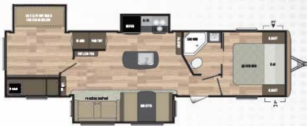
332RB WEIGHT: 9263 LENGTH: 37' 7"