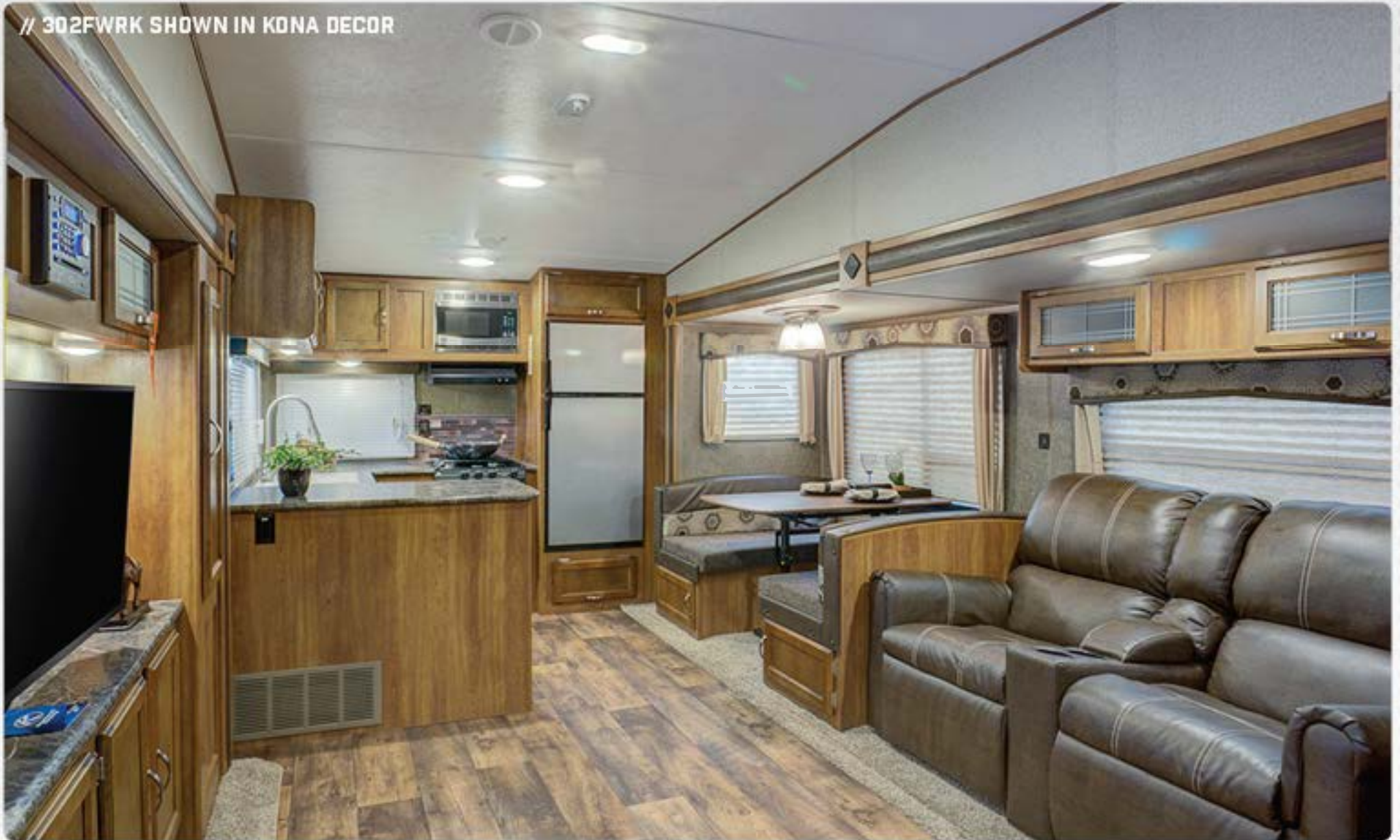
// 302FWRK SHOWN IN KONA DECOR