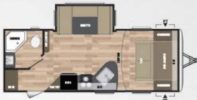
2200MB WEIGHT: 5437 LENGTH: 26' 2"