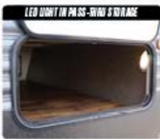
LED LIGHT IN PASS-THRU STORAGE