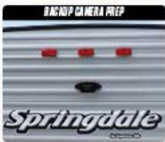
BACKUP CAMERA PREP