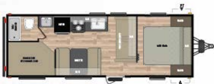
2600TB WEIGHT: 4967 LENGTH: 28' 10"