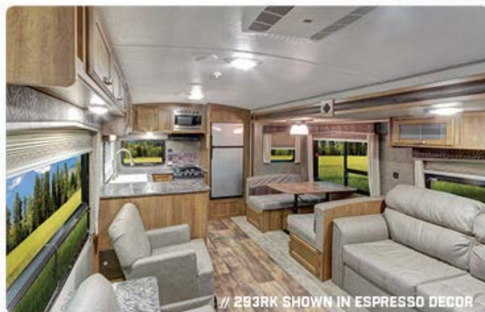
// 293RK SHOWN IN ESPRESSO DECOR