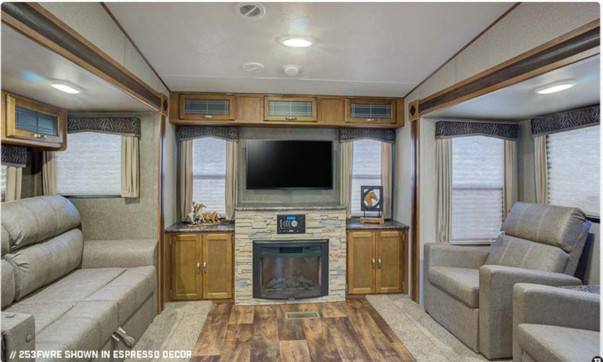
// 253FWRE SHOWN IN ESPRESSO DECOR