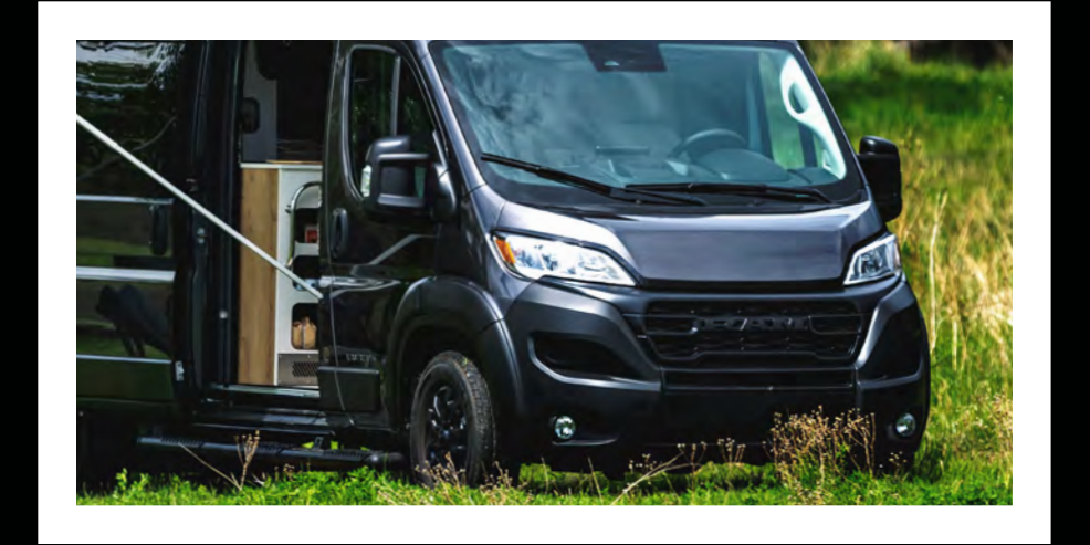
The sleek automotive design features a matte black front grille.