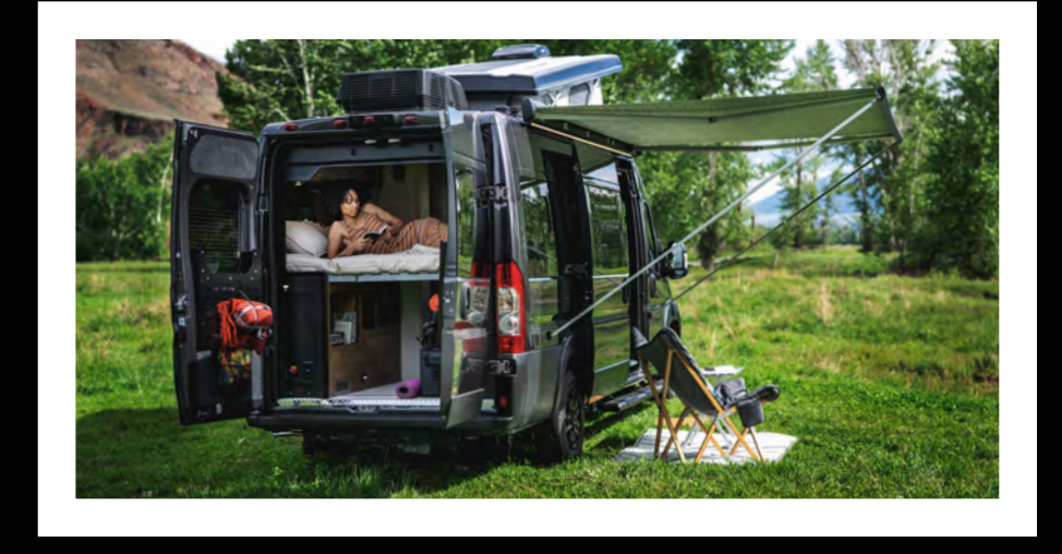
A 12-foot awning with legs expands to create a shady exterior living space.