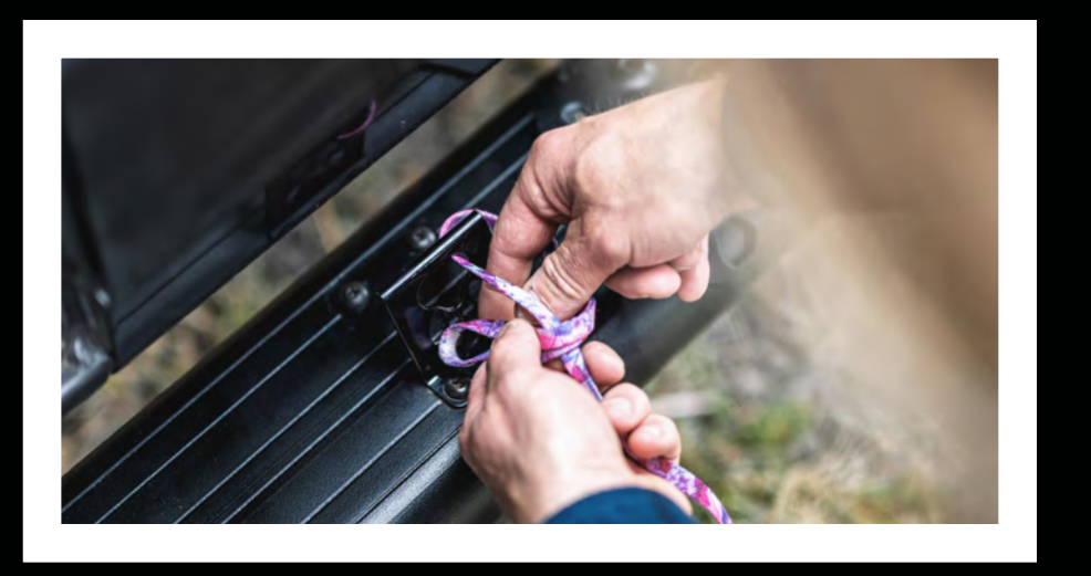
A cleverly designed pet tether lets you safely secure four-legged friends.