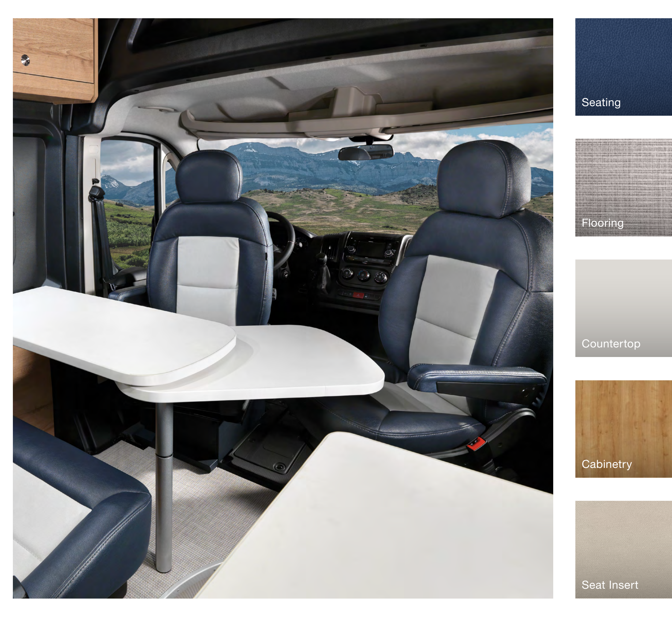
River Oak with Admiral Navy Seating

Traveling and camping with a couple kids in tow can be messy, but the materials make it so easy to clean up. We spend a lot less time cleaning, and more time enjoying the adventure." MARCUS AND JANELLE Rangeline Owners