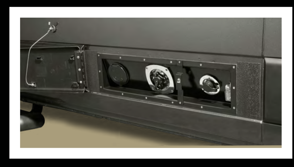
2 Water hookups are concealed behind a natural design.