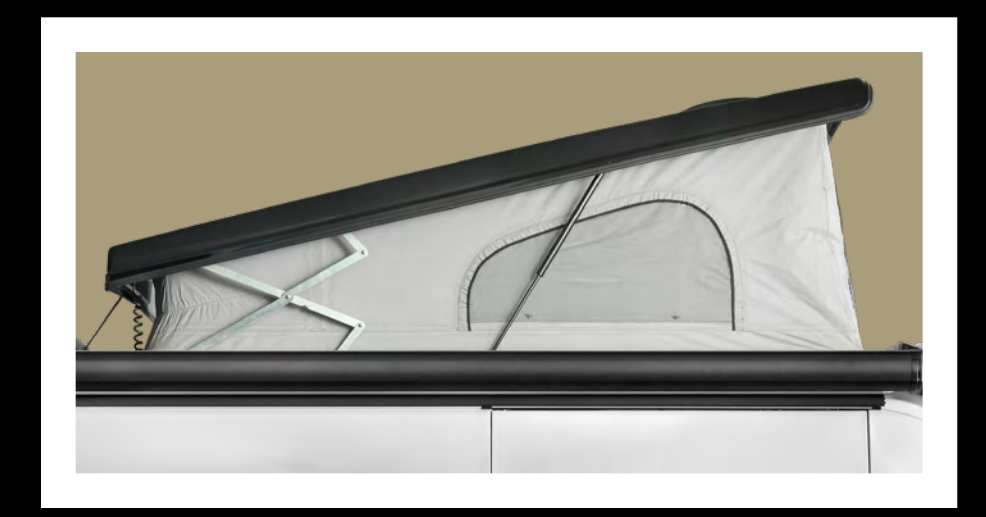
Optional pop-top has a large bed and opens up storage, living, and sleeping areas.