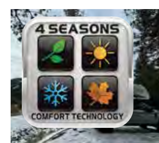
Four Season's Comfort Technology Package – Key features including a heated holding tank design, insulated hatch covers & insulated over-cab bed mat, keep you warmer in the winter and cooler in the summer!