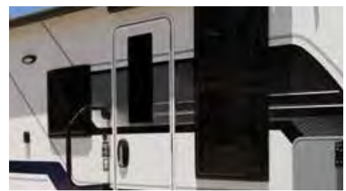
Ultra-Lightweight Dual-Pane Acrylic Euro Windows with built in screen and black-out shade, provide a stylish aesthetic with a wide range of adjustability as desired, from the secured vent only position to wide open for maximum airflow.