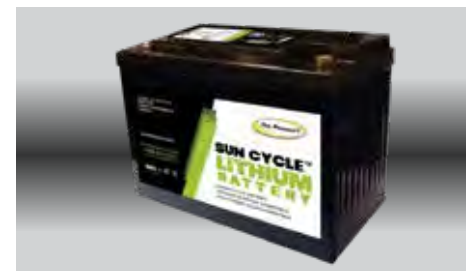
Lithium Batteries (1 or 2) are the latest battery technology offering more usable capacity vs. traditional batteries in a lighter, safer package.