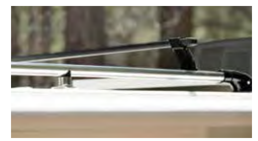
Lance Load Roof Rack - Safely store your canoe, kayak, paddle boards, etc. N/A 1475 & 1575 (Weight Limit 500lbs. Distributed)

It's a short list.....Our lengthy list of standard features, which most competitors call "optional," has no equals. The following additional features is a sample of what is available for those seeking the absolute pinnacle of luxury. Please see pages 16 & 17 for a complete listing of optional equipment.