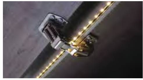
Overhead Cabinetry Construction – Strong yet light Euro-Ply construction, combined with heavy-duty hinges and automatic LED lighting, rival custom residential cabinetry!