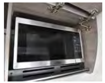
Flat Bottom Microwave - Offers the latest cooking technology.