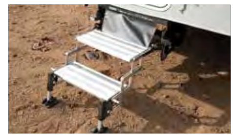
Glow Step Revolution Entry Steps - Provides sturdy, adjustable, glow-in-the-dark steps for safe and secure entrance and exit.