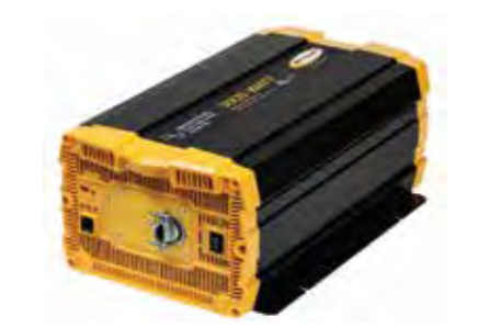
3000W Power Inverter converts battery power to 110V power allowing use of select appliances and devices including laptops, CPAP machines and others, while your away from shore power.