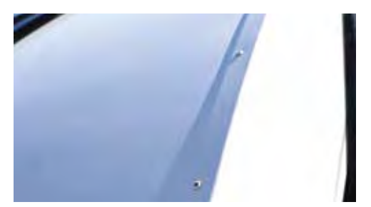
Keeping it all together are stainless steel fasteners. Unlike our competitors, this expensive hardware resists corrosion making for a lasting investment.

Since 1965, Lance Camper has been building the highest quality travel trailers and truck campers, designed to deliver the most value and enjoyment possible. For 2023, we have raised the bar yet again in quality, design, and value. As a result, those who have owned a Lance return again and again. For the first-time buyer, we encourage you to "purchase your last RV, first!"