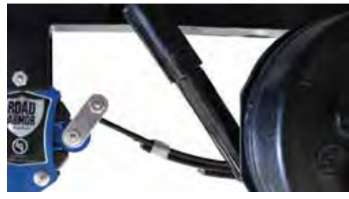
Shock Absorbers - Take your suspension to the next level by protecting your trailer against less than perfect roads and providing an even smoother ride. N/A 1475 & 1575