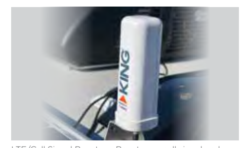
LTE/Cell Signal Booster - Boost your cell signal and reach more cell towers, while multiple users enjoy greater coverage and faster on-line speeds with no extra monthly fees.