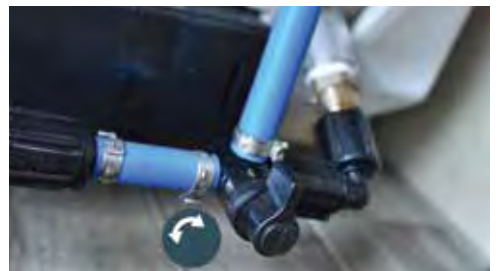
Water heater bypass & winterizing valves make draining the system for winter storage a breeze.