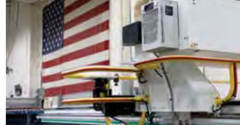
3D advanced CAD engineering create precise plans that run CNC machinery. The result is that every part is the same and perfect every time.

Hollywood, CA, to our current 13-acre campus home in