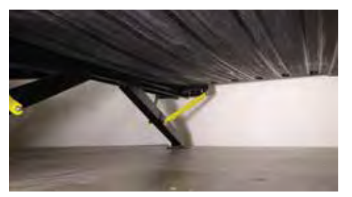
Heat is routed into individually insulated holding tanks to keep them, the valves and PEX lines warm.

Extending your camping season in comfort, Lance's Four Seasons Comfort Technology package is standard equipment on every Lance. The intentional selection of several vital features combines to ensure you and your loved ones stay comfortable as you explore during the "shoulder seasons"!