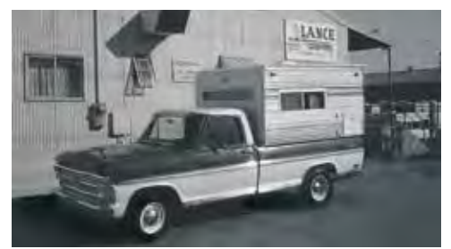
California Roots - From humble beginnings in North Hollywood, CA, in 1965 to our current home in Lancaster, CA, as a result of a fierce dedication towards building the highest quality RVs possible, understanding our customer's needs and insulated from the "me too" designs of our competitors, the Lance brand has become one of the most respected and sought-after brands in the industry.

Over 50 years of quality and industry-leading innovations have positioned the Lance brand as one of the most sought-after RVs on the road today. Respect is earned and not easily obtained in today's competitive marketplace.