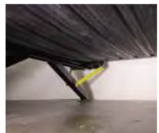
Electric Stabilizer Jacks W/Footpad - Make setup & teardown sweat free, keeping your trailer stabilized while parked. - N/A 1475 & 1575