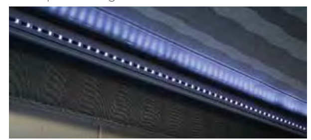
Latitude Powered Awning – Provides unobstructed shade with direct response wind sensor & LED light bar.

What other manufacturers call optional, along with Lance quality, our customers enjoy 20+ of the most requested features as standard equipment. Below is a sampling of the more popular options, please see pages 16 & 17 for a complete listing.