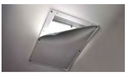
Hand sewn in our facility, the insulated hatch covers add an additional layer of insulation to vents and sky lights.