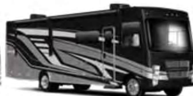
Full Body Paint - Midnight Platinum