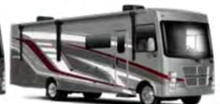
Full Body Paint - Starlight Ruby