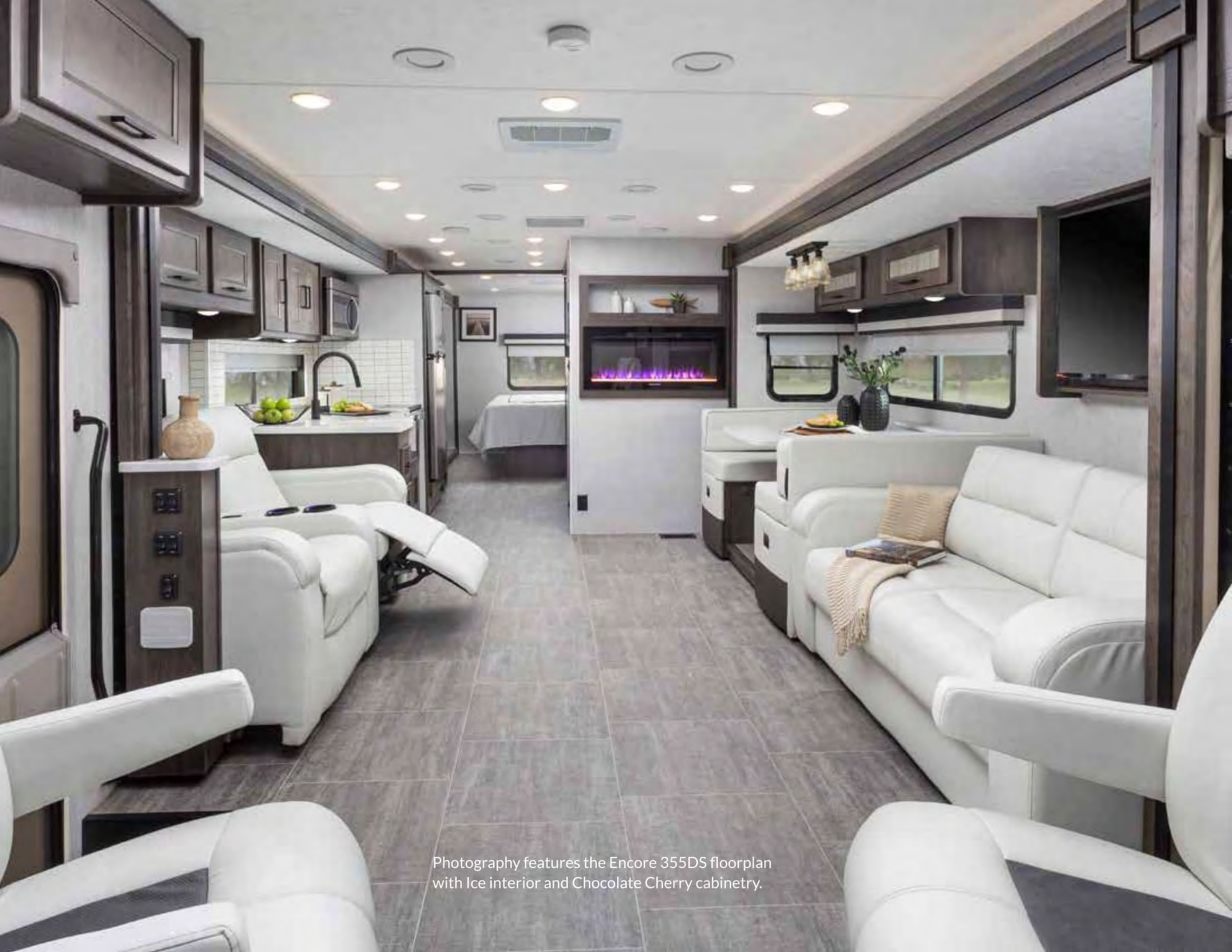
Photography features the Encore 355DS floorplan with Ice interior and Chocolate Cherry cabinetry.