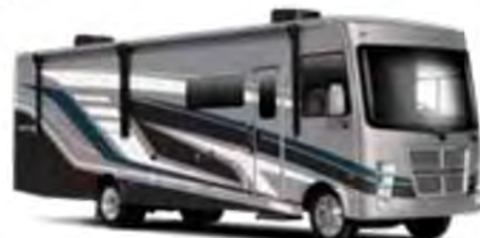
Full Body Paint - Coastal Iron