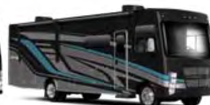
Full Body Paint - Night Quartz