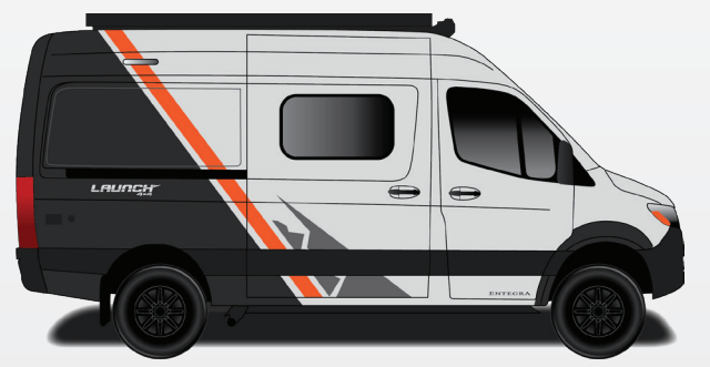
Aztec Partial Paint (Silver Van Only)