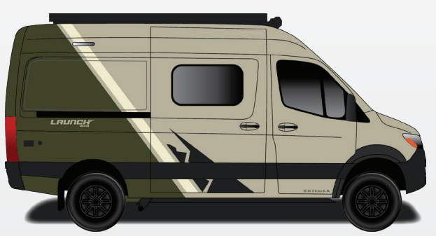
Forest Glade Partial Paint (Sandstone Van Only)