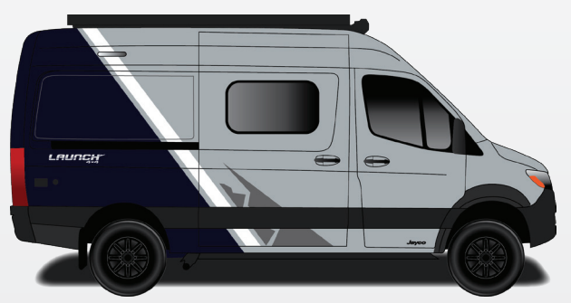
Mystic Tide Partial Paint (Blue-Grey Van Only)