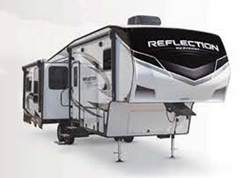
150 Series Fifth Wheels