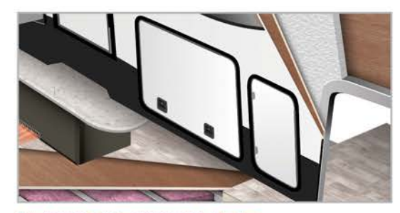
HEAVY DUTY INSULATED BAGGAGE DOORS

The slideroom floors are also insulated with radiant foil. (R-24)*