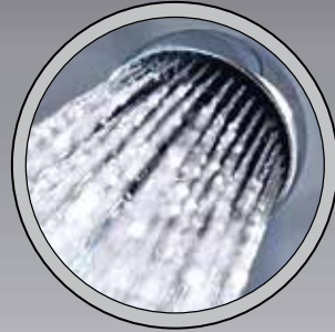
18 GPH DSI WATER HEATER