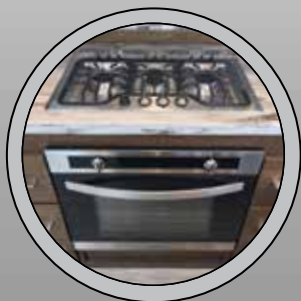
FURRION RESIDENTIAL COOKTOP AND OVEN