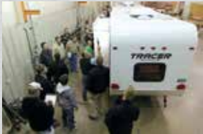
Executive Quality Audits