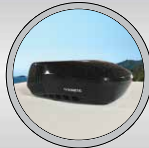
15K "QUIET COOL" A/C