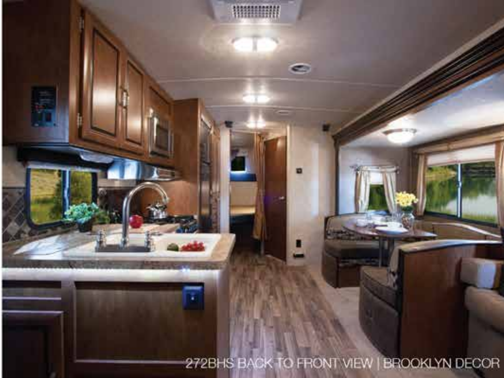
272BHS BACK TO FRONT VIEW | BROOKLYN DECOR