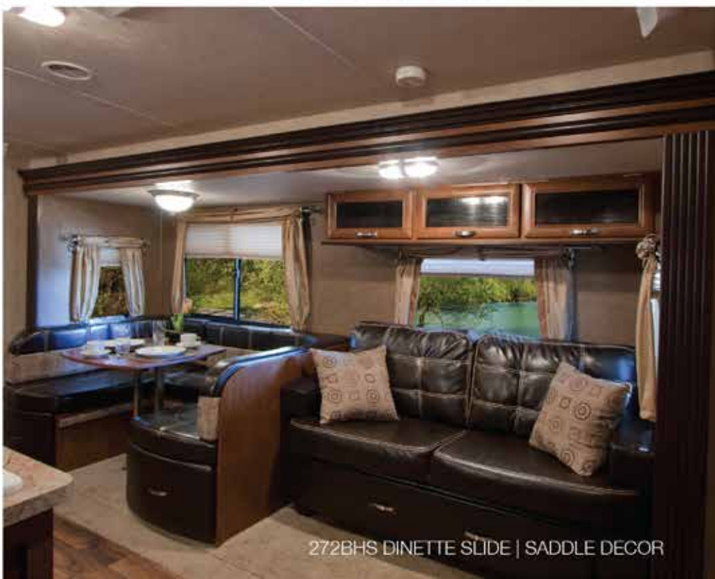
272BHS DINETTE SLIDE | SADDLE DECOR