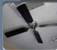
Ceiling Fan in Living Area