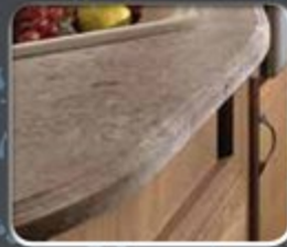
Solid Thermofoil Countertop with Waterfall Edge