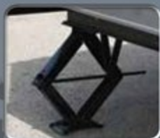
Four (4) Stabilizer Jacks