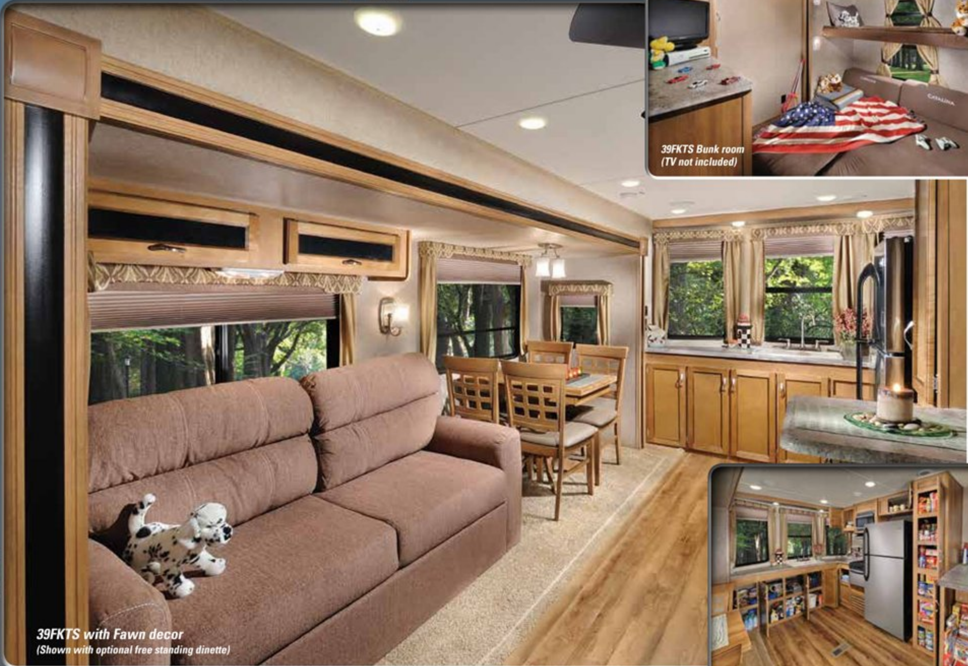
39FKTS with Fawn decor (Shown with optional free standing dinette)