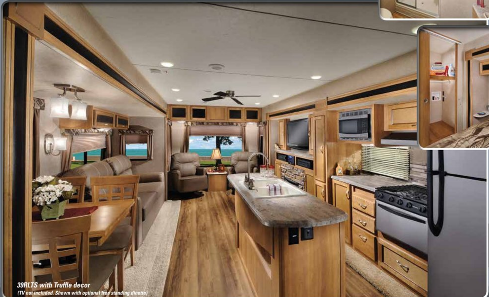
39RLTS with Truffle decor (TV not included. Shown with optional free standing dinette)