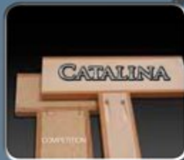
Real Wood, Screwed Cabinet Fascia with Lumber Core Stiles, NOT Stapled Particle Board Like Most Brands.