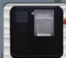
10 Gal. DSI Gas/Electric Water Heater