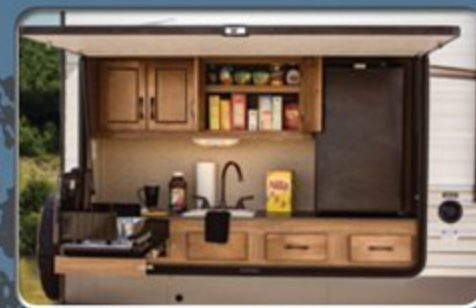
40BHTS Exterior Camp Kitchen