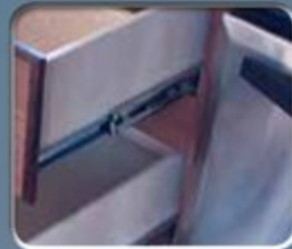
Metal Drawer Guides