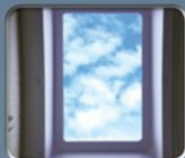
Skylight Above Tub/Shower