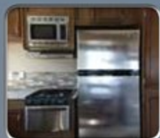
Stainless Steel Appliance Package