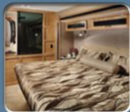
Designer Bedroom with Quilted Bedspread, Pillow Shams, Serta Mattress and Custom Headboard