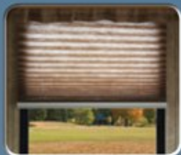
Pleated Night Shades