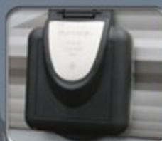
Solar Panel Prep