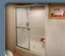
Fiberglass Shower with Sliding Door