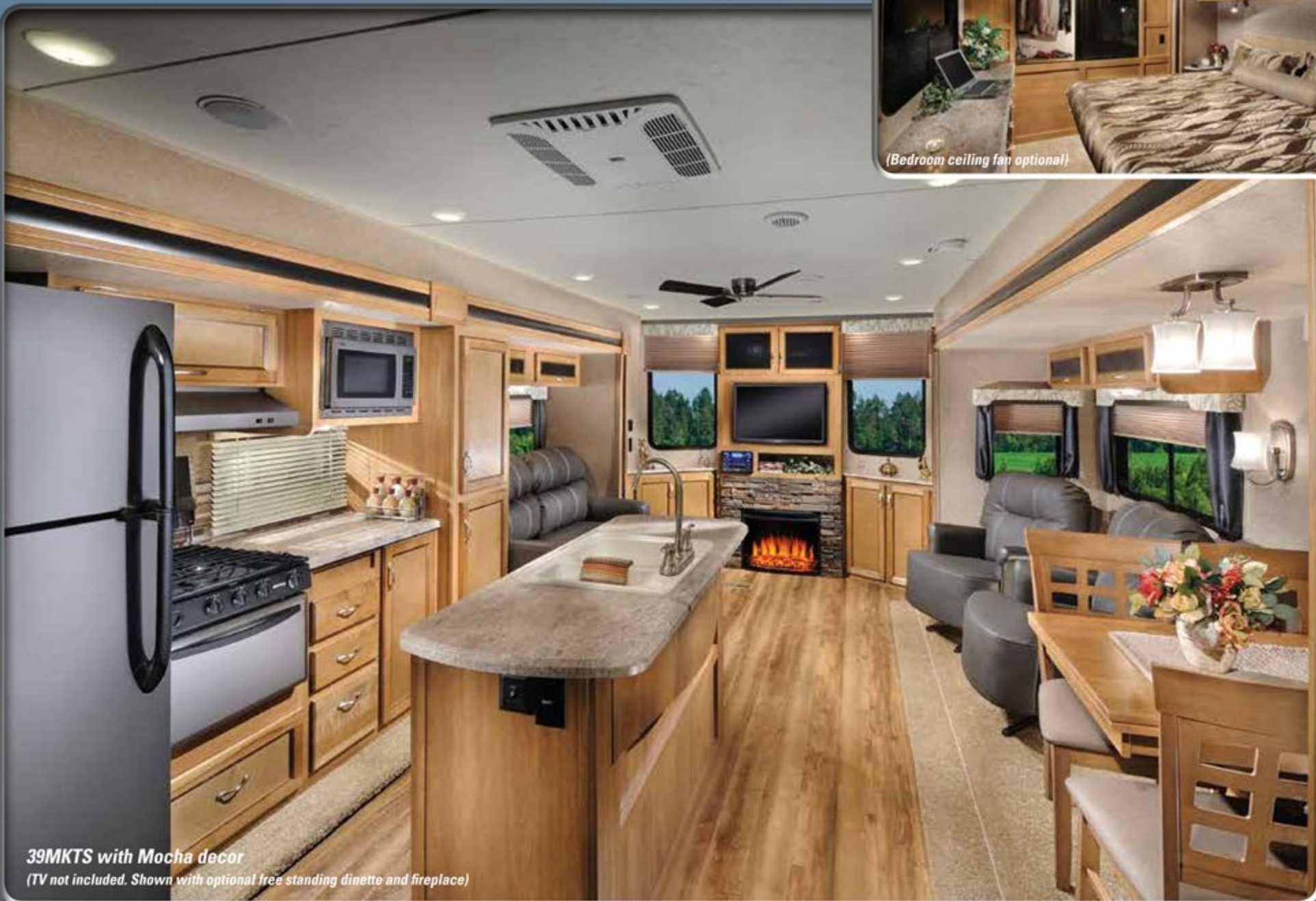
39MKTS with Mocha decor (TV not included. Shown with optional free standing dinette and fireplace)