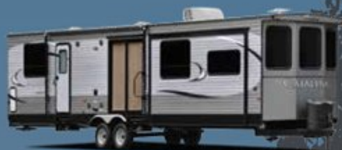
Platinum and Charcoal Exterior