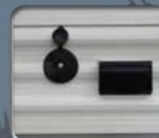
Antenna with Interior and Exterior Hook-Ups