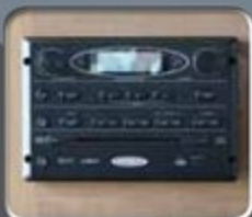
Multimedia DVD/CD Radio with USB Input