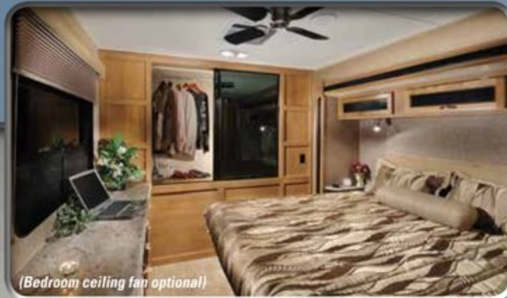
(Bedroom ceiling fan optional)

The Catalina 39MKTS is a triple slide couples camper. It has opposing slides in the living area and kitchen to give you even more space! This is your future home away from home.