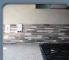
Kitchen Wall Border