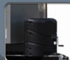
Two (2) 30 Lbs. LP Tanks w/ ABS Tank Cover