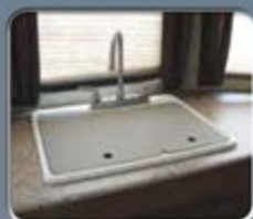
Dual Sink Covers/Cutting Board Combination