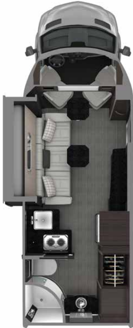
Atlas Lounge Slide-Out