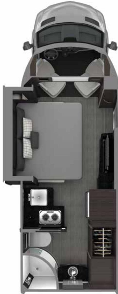
Atlas Sleeping Quarters