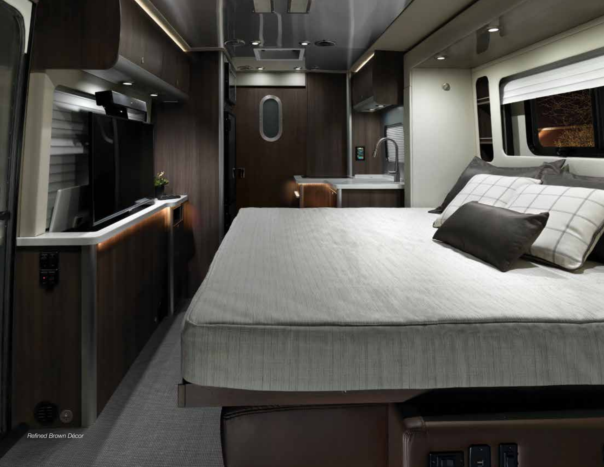
Refined Brown Décor