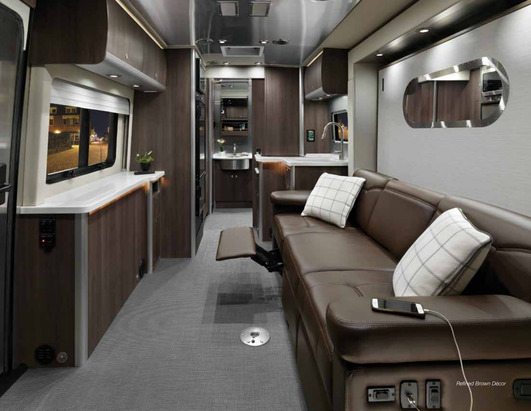
Refined Brown Décor