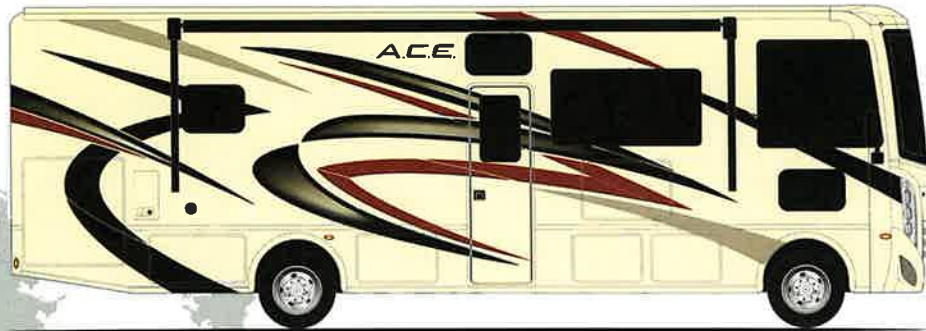
RAVISHING RED HD-MAX