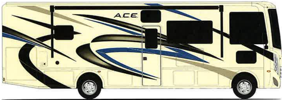
INDEPENDENCE BLUE HD-MAX