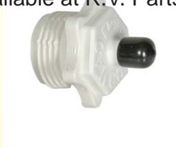
R.V. Blow Out Plug