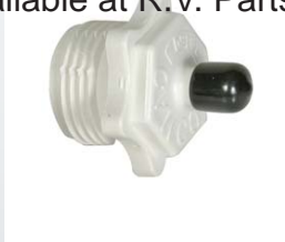
R.V. Blow Out Plug