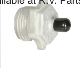
R.V. Blow Out Plug