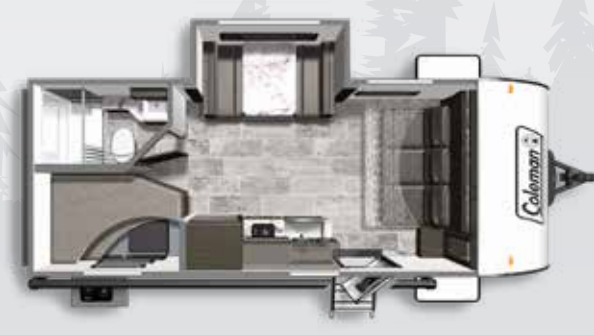
LIGHT LX 1905BH Length: TBD Weight: TBD Sleeps: TBD Hitch: TBD Height: TBD