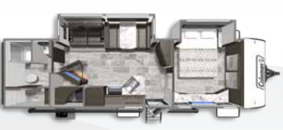
LIGHT 3055BS Length: 34' 11" Weight: 7,346 lbs. Sleeps: 2-4 Hitch: 870 lbs. Height: 11' 5"