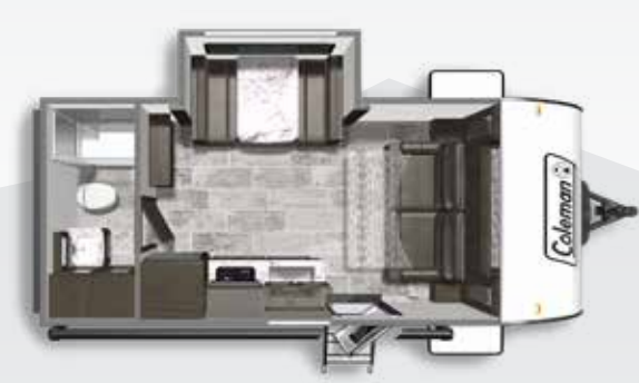
LIGHT LX 1855RB Length: 22'11" Weight: 4,097 lbs. Sleeps: 2-3 Hitch: 743 lbs. Height: 10'7"