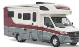
CATALINA WINE MIXER

* Estimated storage without optional generator. Rear garage equates for 68 cu. ft. of storage.