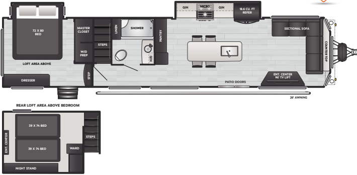
40/401FLSL | WEIGHT 12180 | LENGTH 42' 11"