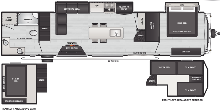
40/401CLDL | WEIGHT 12585 | LENGTH 42' 11"