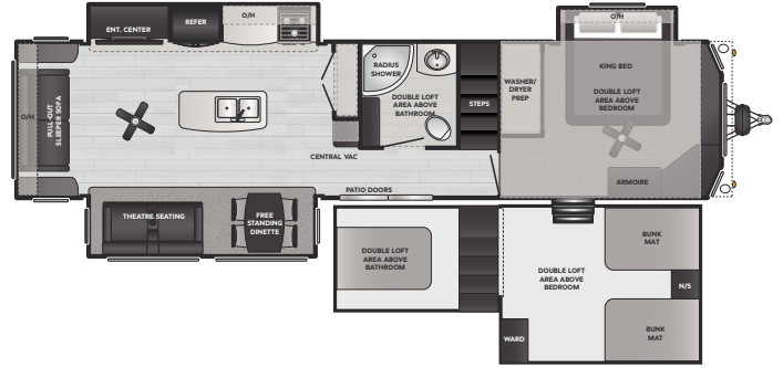
40/401FLFT | WEIGHT 12890 | LENGTH 40' 11"