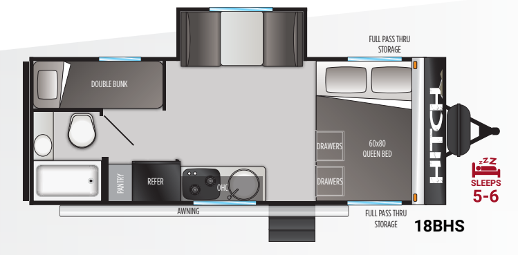
Length - 22'9" Dry - 4030 lbs. Height - 10'5"