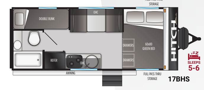
Length - 21'1" Dry - 3,342 lbs. Hitch - 426 lbs.