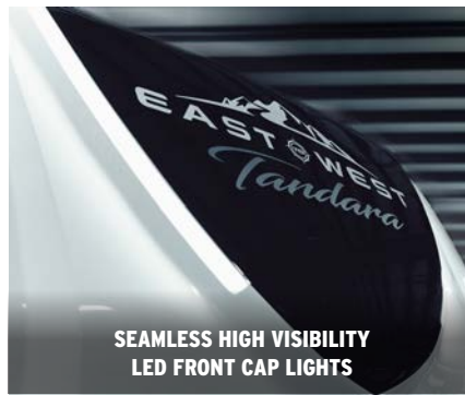
SEAMLESS HIGH VISIBILITY LED FRONT CAP LIGHTS