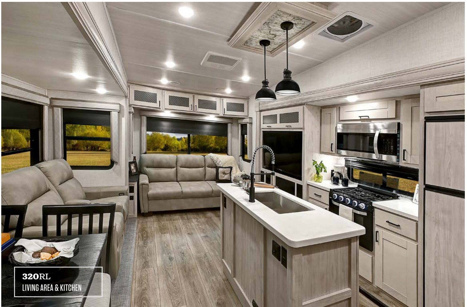
320RL LIVING AREA & KITCHEN