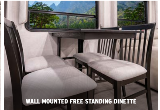
WALL MOUNTED FREE STANDING DINETTE