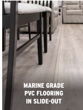
MARINE GRADE PVC FLOORING IN SLIDE-OUT