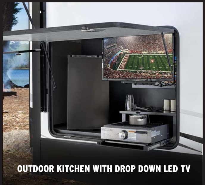
OUTDOOR KITCHEN WITH DROP DOWN LED TV