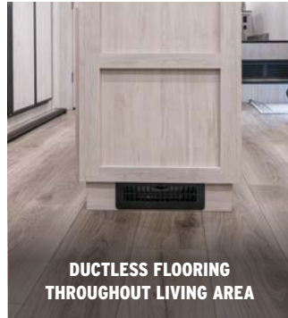
DUCTLESS FLOORING THROUGHOUT LIVING AREA