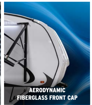
AERODYNAMIC FIBERGLASS FRONT CAP