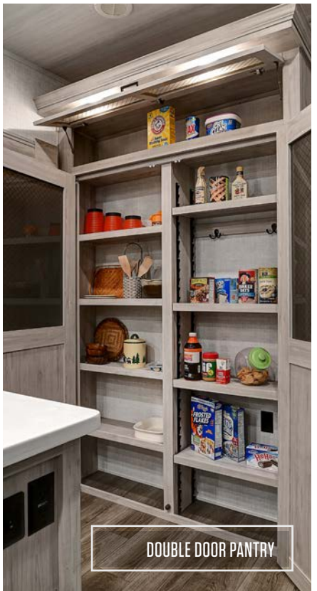
DOUBLE DOOR PANTRY