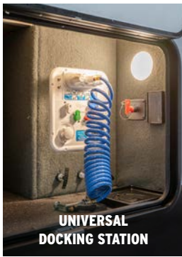
UNIVERSAL DOCKING STATION