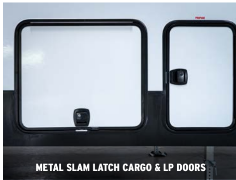
METAL SLAM LATCH CARGO & LP DOORS