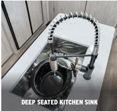
DEEP SEATED KITCHEN SINK