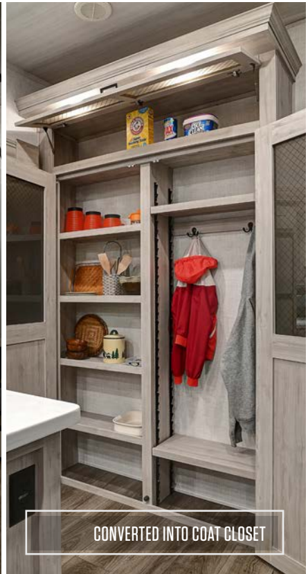
CONVERTED INTO COAT CLOSET