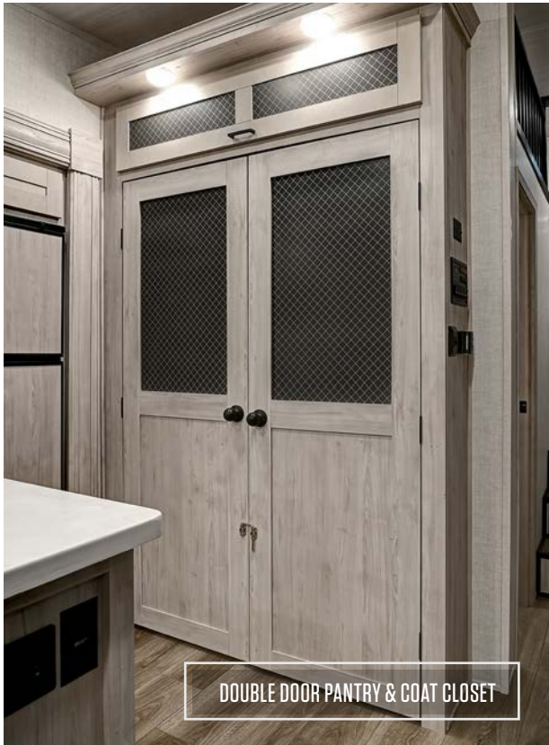
DOUBLE DOOR PANTRY & COAT CLOSET