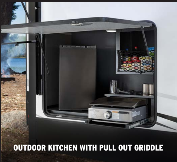
OUTDOOR KITCHEN WITH PULL OUT GRIDDLE

Built to withstand the elements with powder coated metal countertops and cabinet, the TANDARA outdoor kitchen includes a large refrigerator, combination griddle and grill, motion sensor lighting and a 32" LED TV mounted on an electric lift.