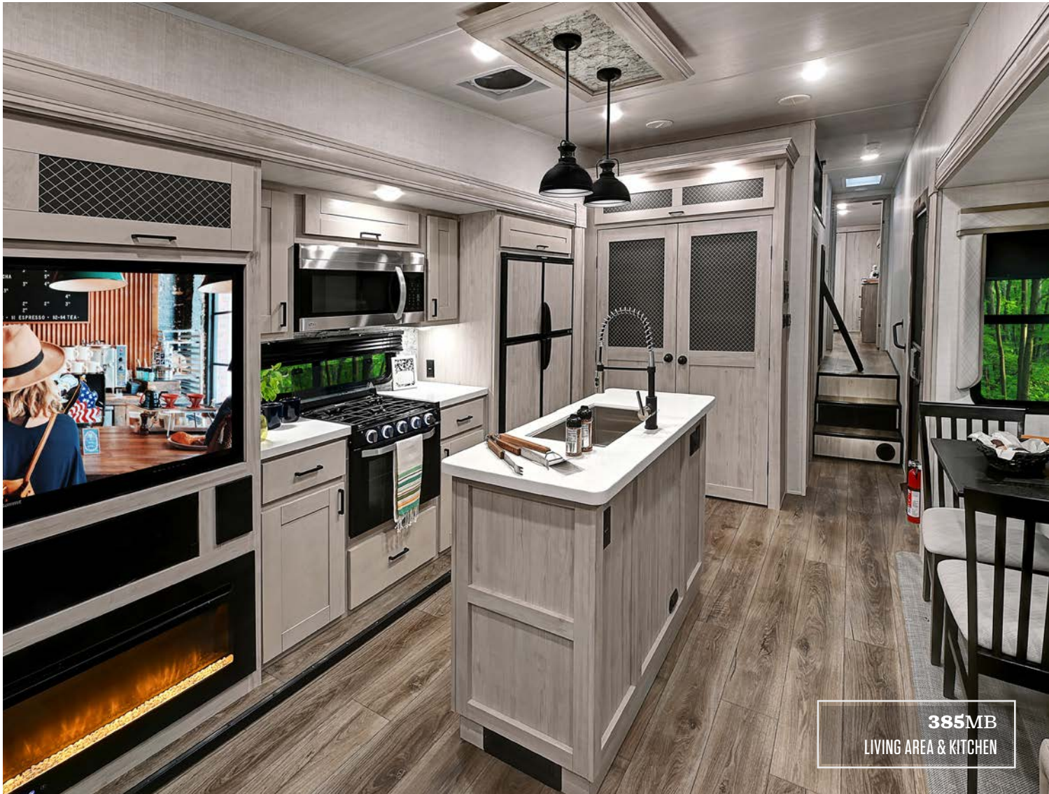
385MB LIVING AREA & KITCHEN