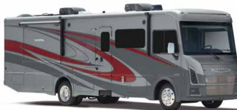
TOREADOR Full-body paint