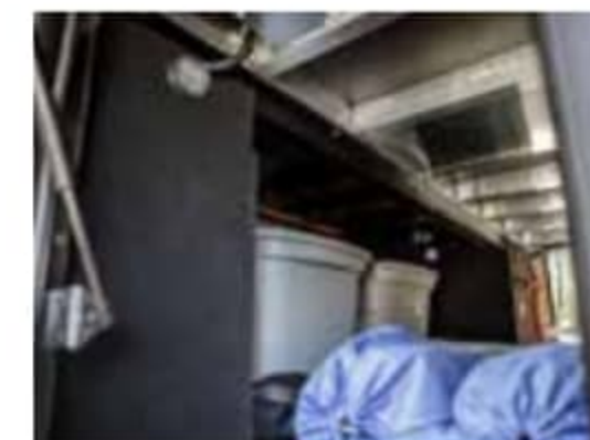
Stor More Basement