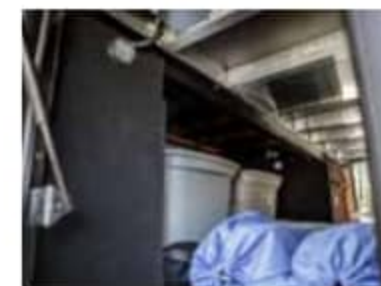
Stor More Basement