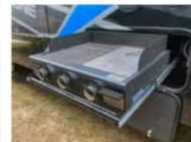
Grill N Go