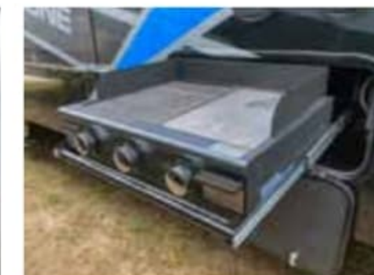
Grill N Go