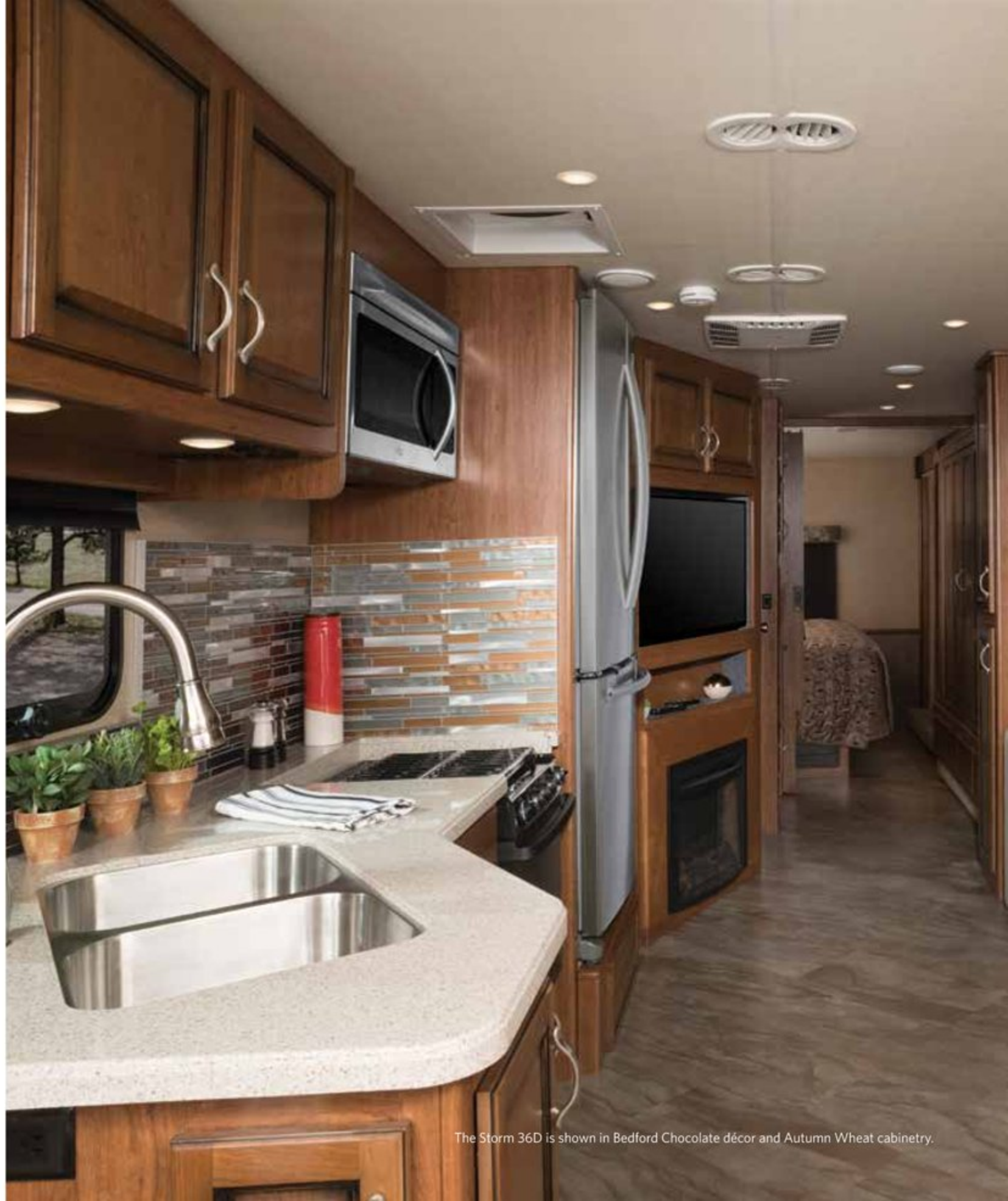
The Storm 36D is shown in Bedford Chocolate décor and Autumn Wheat cabinetry.

*Based on IHS Automotive, Polk Recreational Vehicles in Operation (RVIO) as of 7/1/13.