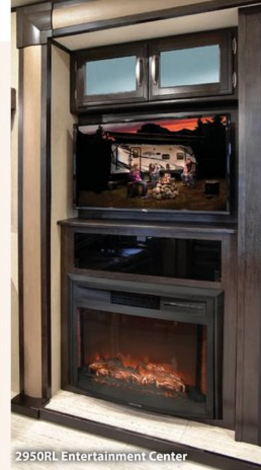
2950RL Entertainment Center