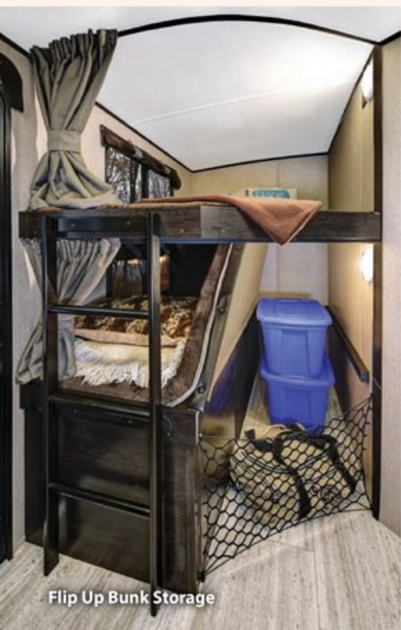
Flip Up Bunk Storage