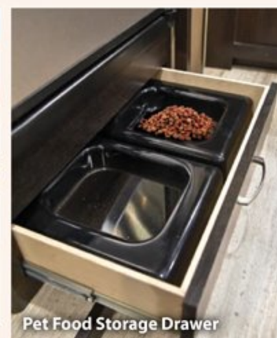
Pet Food Storage Drawer