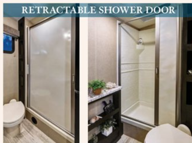
RETRACTABLE SHOWER DOOR