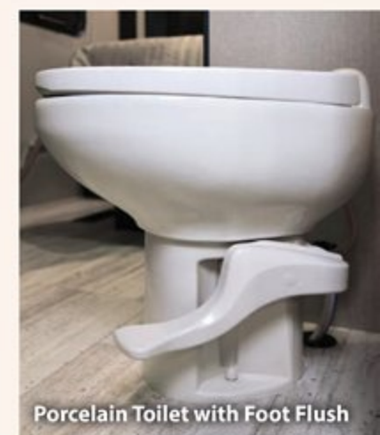
Porcelain Toilet with Foot Flush