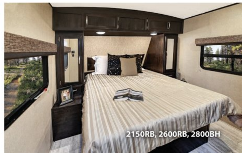
2150RB, 2600RB, 2800BH