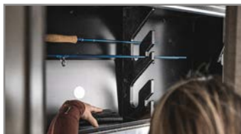
Large hidden storage for fishing poles or hunting rifles