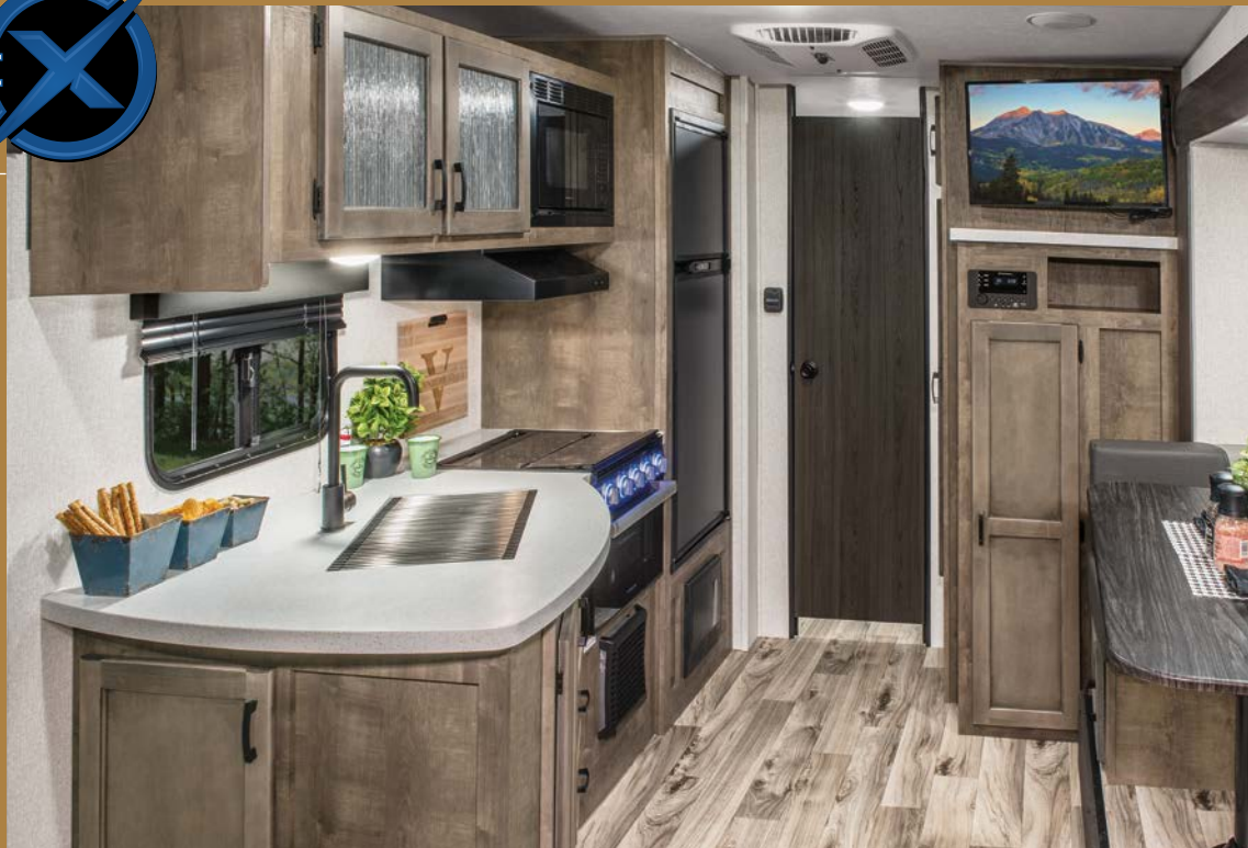
Sonic X interiors include solid wood cabinets with roller ball bearing drawer guides, a large undermount stainless steel single bowl sink, and two interior speakers.