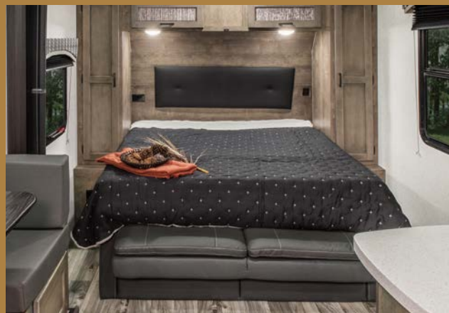
In the bed area, Sonic X offers a Murphy bed with foam mattress upgrade, StorMore nightstands with 110V and USB port, under-bed storage, and two shirt closets.