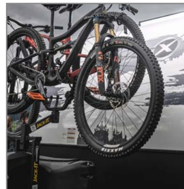
Front-mounted bike rack holds up to two bikes