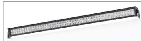
Front & rear LED light bars assist in loading & unloading