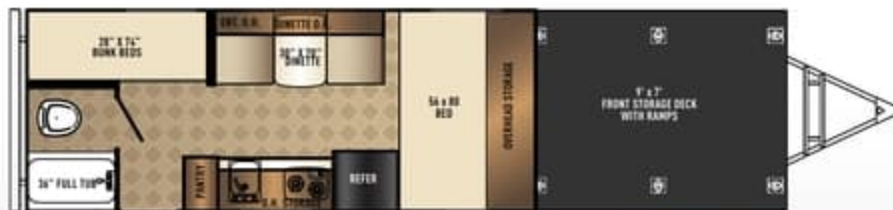
177 ORV BH