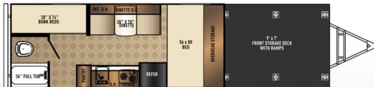
177 ORV BH