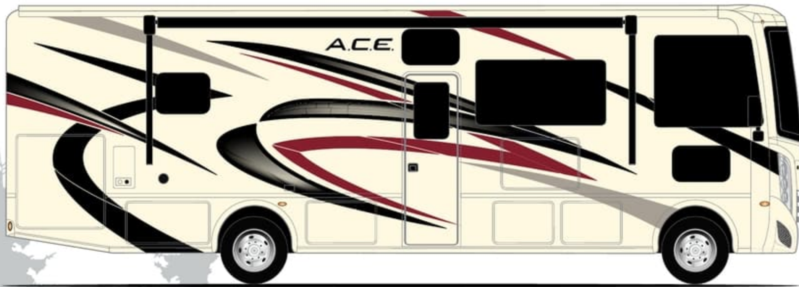
RAVISHING RED QHD-MAX