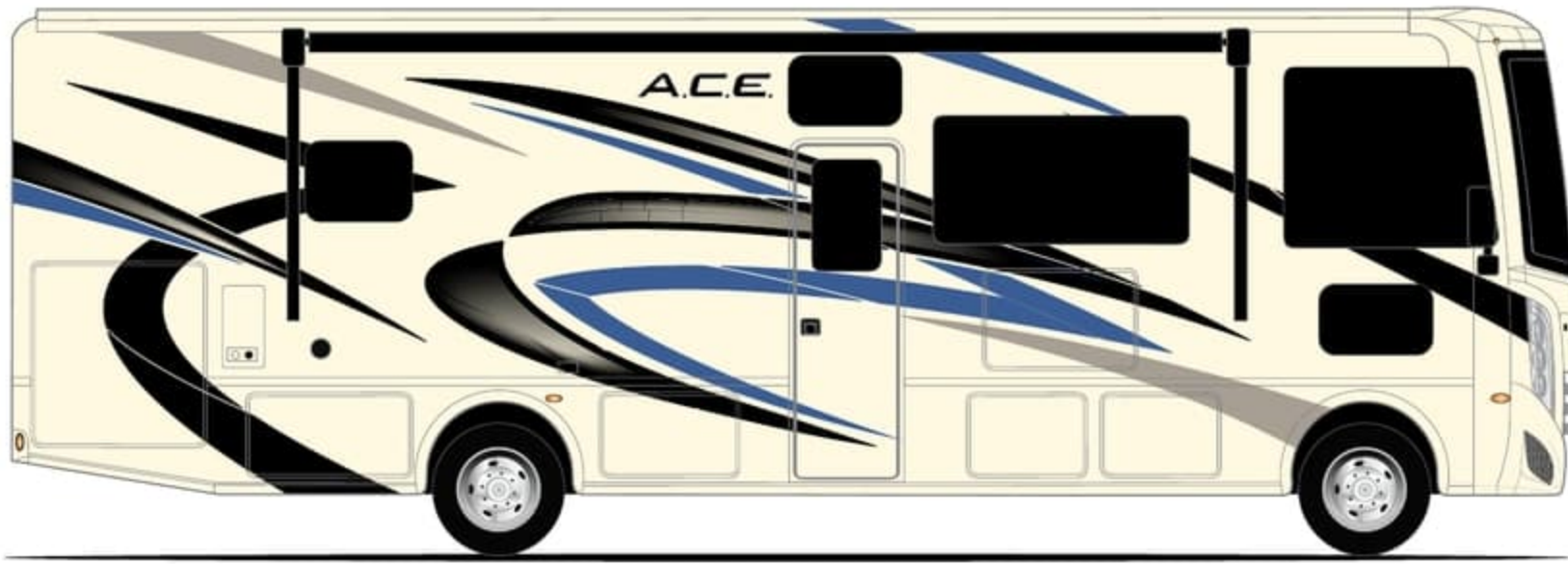
INDEPENDENCE BLUE QHD-MAX