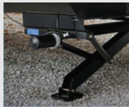
POWER STABILIZER JACKS (SSR ONLY)