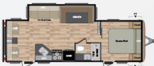
266RLWE WEIGHT: 6213 LENGTH: 28' 11"