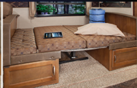
SLEEPING SPACE FOR TWO ADULTS