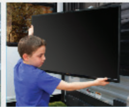
OUTDOOR TV BRACKET