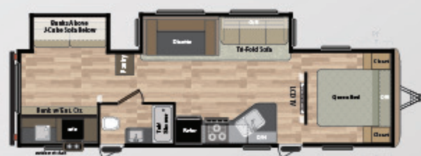
303BHEW WEIGHT: 7797 LENGTH: 34' 11"