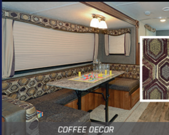
282BHWE SHOWN IN COFFEE DECOR