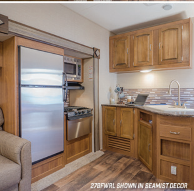
278FWRL SHOWN IN SEAMIST DECOR