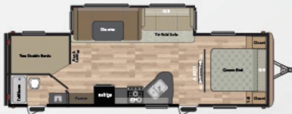
282BHEW WEIGHT: 6791 LENGTH: 32' 1"