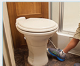
PORCELAIN FOOT FLUSH TOILET