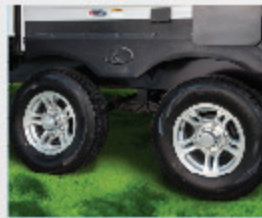
WIDE STANCE AXLES (Slide Out Models)