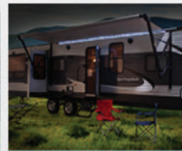
POWER AWNING W/ LED LIGHTS