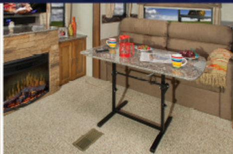
EXTRA COUNTER TOP SPACE CARD TABLE / PICNIC TABLE