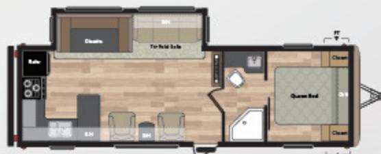
293RKWE WEIGHT: 6774 LENGTH: 32' 11"