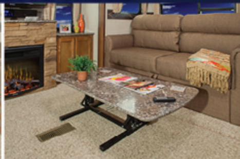
COFFEE TABLE / OTTOMAN