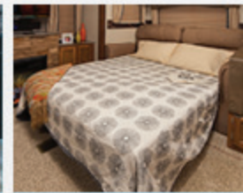
TRI-FOLD SLEEPER SOFA (SSR)