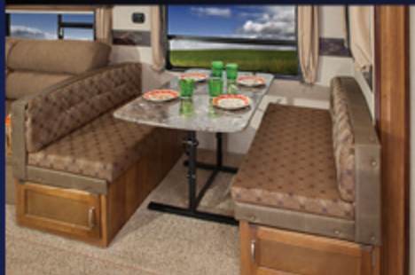
STANDARD IN ALL SPRINGDALES