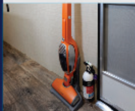
DUAL FUNCTION CORDLESS VACUUM