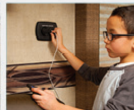
DIGITAL CHARGING STATION