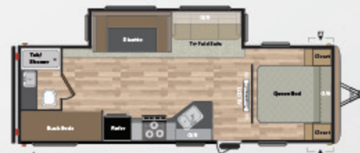
267BHEW WEIGHT: 6132 LENGTH: 28' 11"