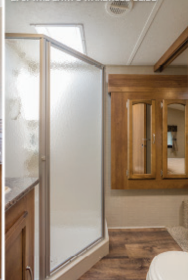
278FWRL BATH & WARDROBE SLIDE

Springdale is a leader not only in Travel Trailers, but 5th wheels as well. If you are a camper in your early stages and looking for a little more room, or a more experienced traveler and ready for something a little larger, Springdale has you covered. Springdale 5th wheels are equipped with everything you need for a weekend getaway or an extended excursion. With Springdale you will find form and function come together whether you're looking for a family unit with bunks or something just for 2. Oversized windows, full size bathrooms, significant storage inside and out, enhanced colored exterior and many other standards and options make Springdale 5th wheels a true leader in camping and value!