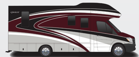
Sunrise Full-Body Paint