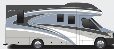
Sea Mist Full-Body Paint