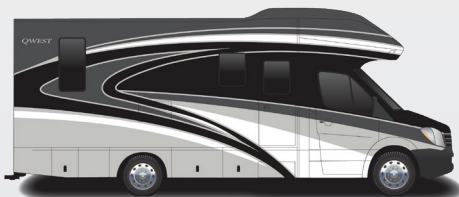
Moonlight Full-Body Paint