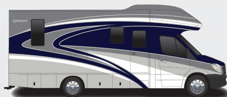
Ozark Full-Body Paint