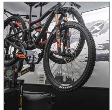
Front-mounted bike rack holds up to two bikes