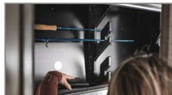
Large hidden storage for fishing poles or hunting rifles