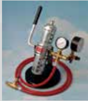
Seek-A-Leak Pressure Test

Prime Time Manufacturing is proud to be recognized as an industry leader in value, reliability, and overall quality by the Recreational Vehicle Dealers Association. We are committed to "A Higher Standard" in design, construction, testing, and customer service. Check us out — we know you'll be impressed!