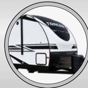
AERODYNAMIC PROFILE WITH ROCK GUARD