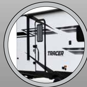
FRICTION HINGE ENTRY DOOR