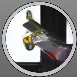
EXTERIOR BOTTLE OPENER