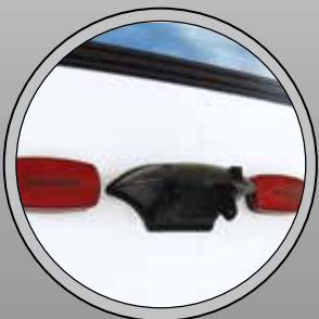
BACK UP CAMERA PREP