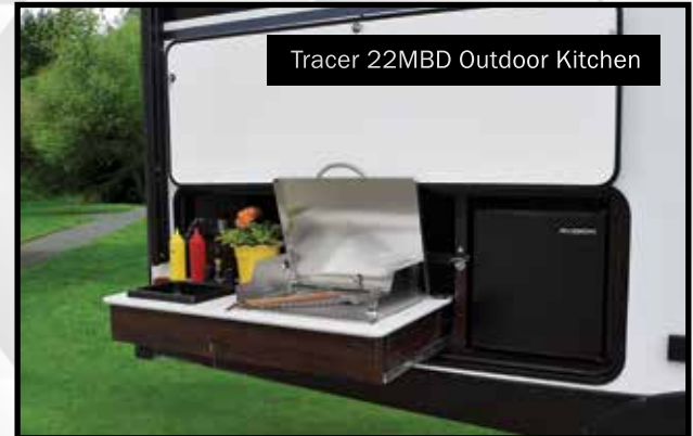
Tracer 22MBD Outdoor Kitchen