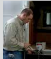
65 Point Secondary PDI