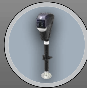
ELECTRIC TONGUE JACK (N/A BREEZE)