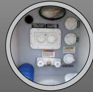
UNIVERSAL DOCKING CENTER (N/A BREEZE)