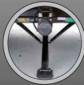
ELECTRIC STABILIZER JACKS (N/A BREEZE)