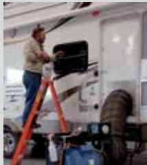
Seal Tech Air Pressure Test