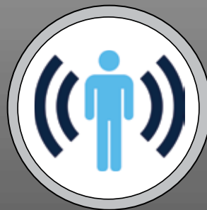
MOTION SENSOR LIGHTING