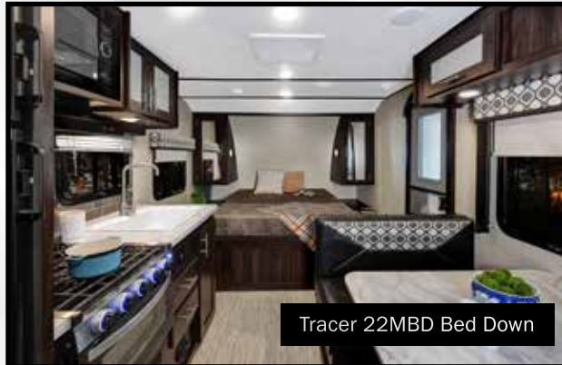
Tracer 22MBD Bed Down