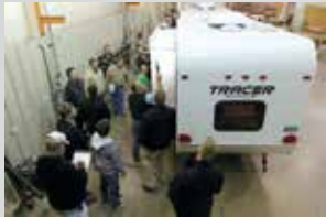
Executive Quality Audits