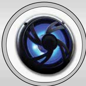
BLUE LED LIT OUTDOOR SPEAKER