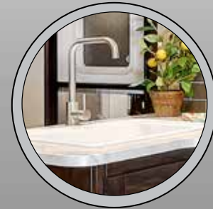
RESIDENTIAL SEAMLESS COUNTERTOPS