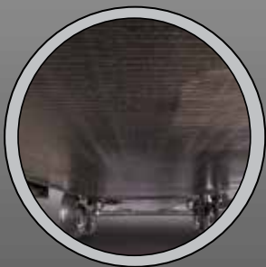
HEATED & ENCLOSED UNDERBELLY