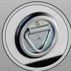
DOGGY D-RING PET SECUREMENT