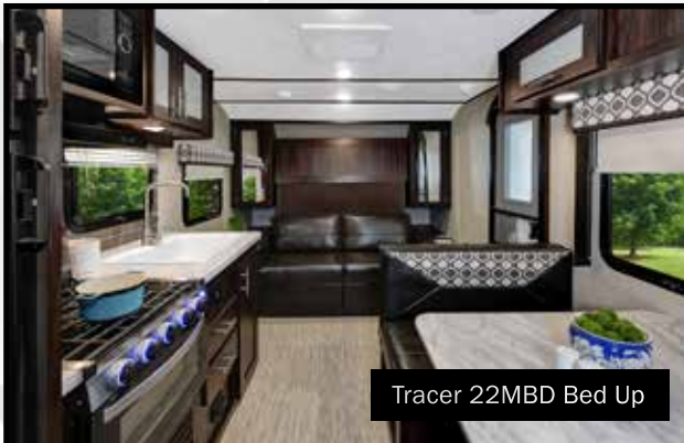
Tracer 22MBD Bed Up