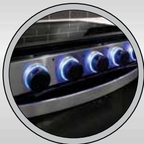
GLASS TOP STOVE WITH LED LIGHTING