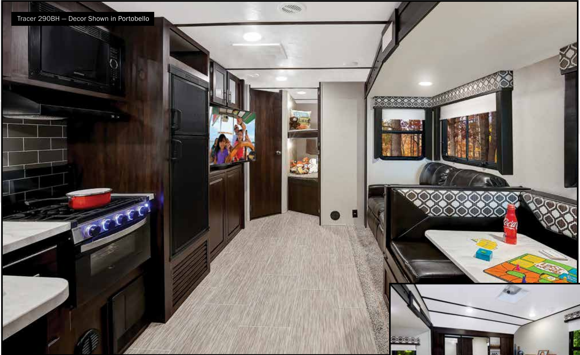
Tracer 290BH — Decor Shown in Portobello

For the consumer who is looking for ultra-light weights but doesn't want to sacrifice style, amenities, and comfort . . . we've designed the Tracer series travel trailers.